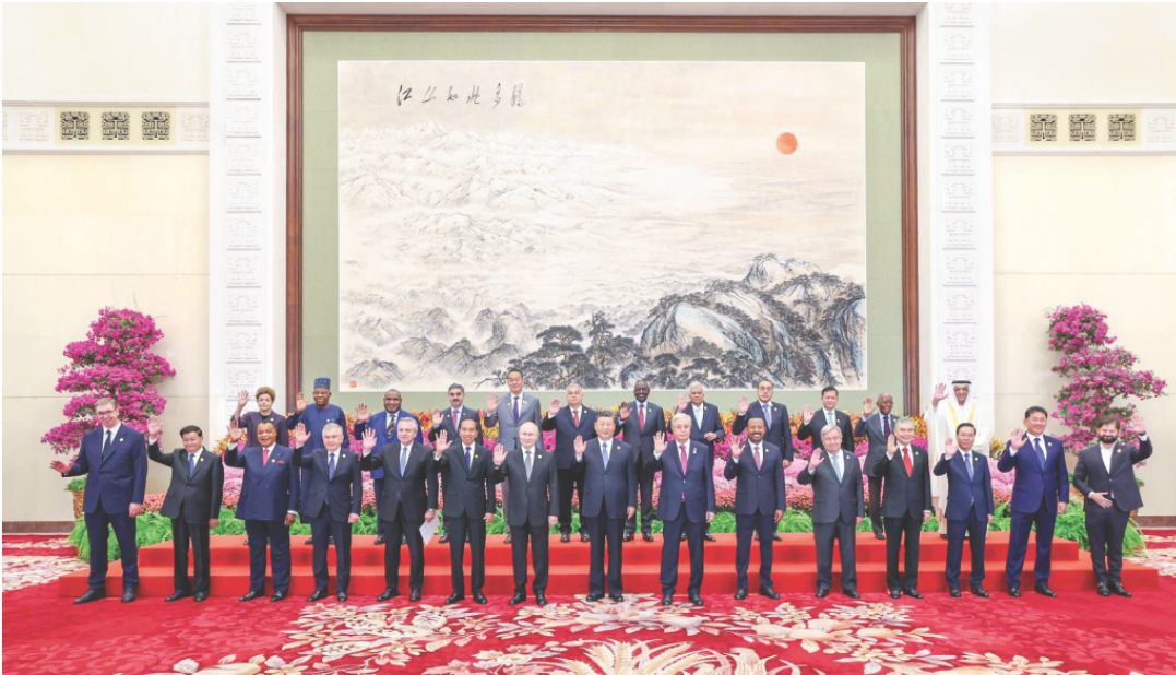
Several heads of states at the Third Belt and Road Initiative (BRI) forum.