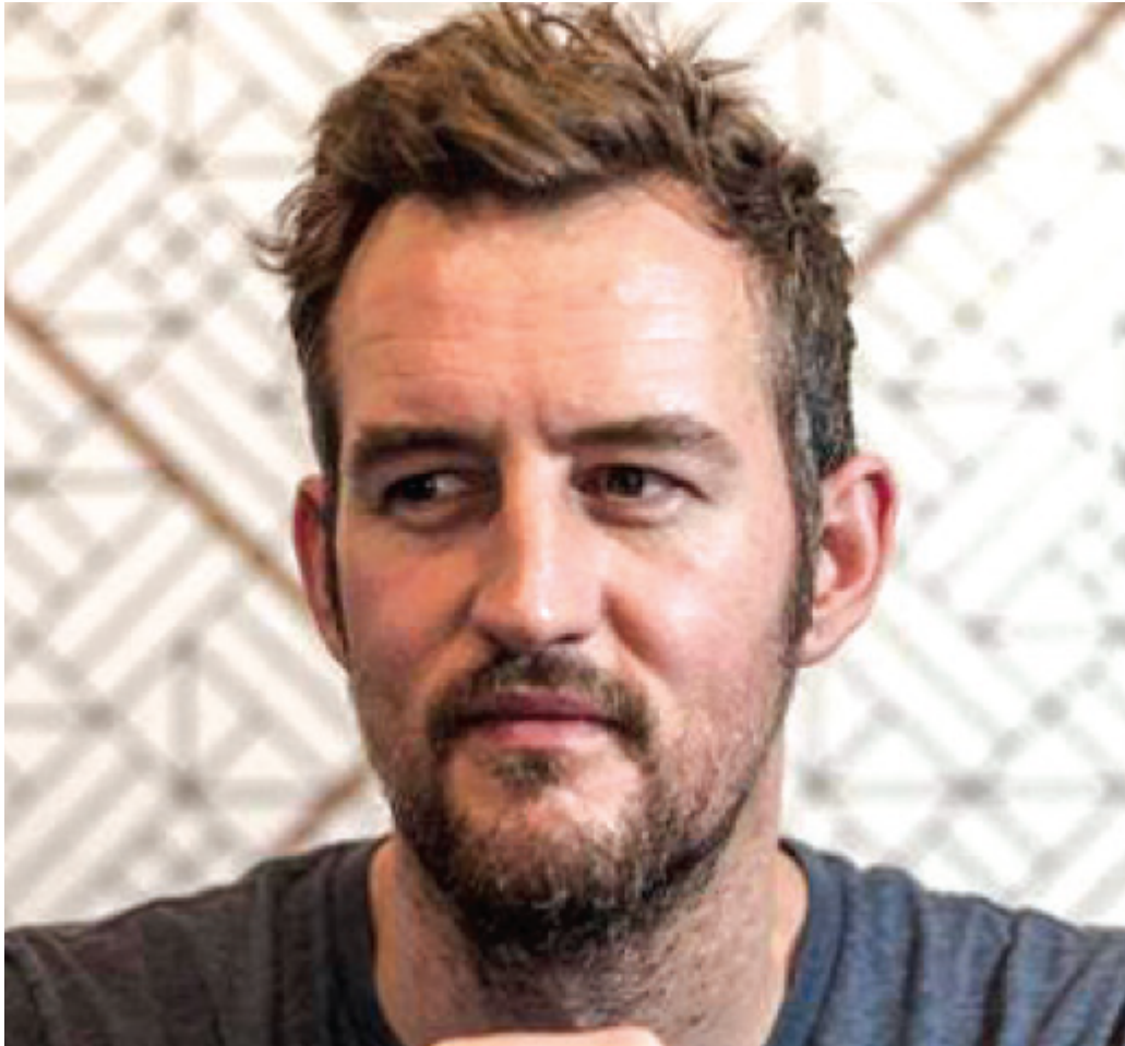
Miguel McKelvey, Co-founder, WeWork.

spending, while also mismanaging and misallocating funds. In the case of WeWork, it was operating in a volatile market, which demanded a reactive and prepared mindset to changes and vigilance to market instabilities. WeWork wants to continue and resurrect itself. Hopefully, unlike Humpty Dumpty, someone will be able to put WeWork back together after the fall.