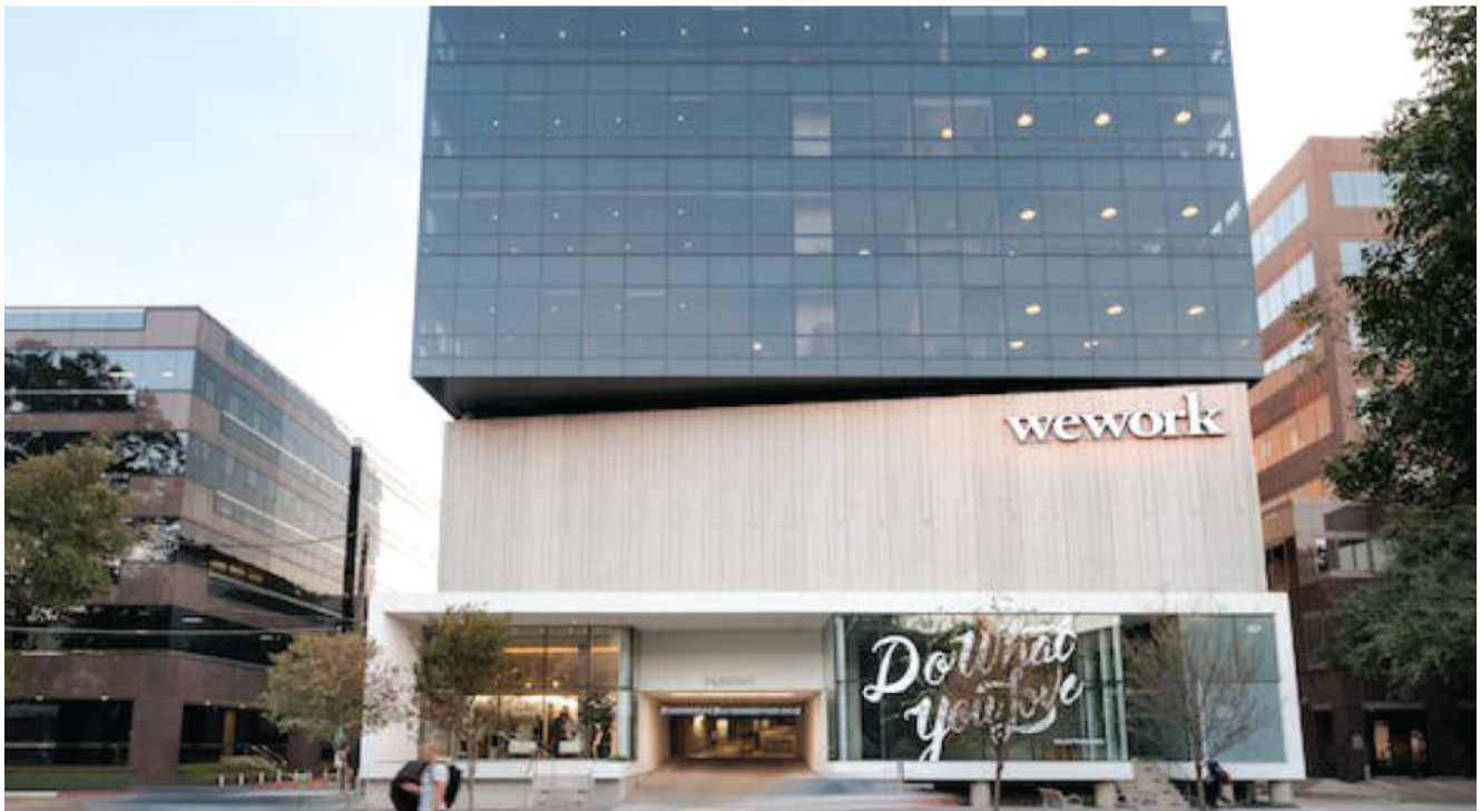
WeWork office spaces.

Masayoshi Son, the founder of SoftBank, the majority shareholder of WeWork and one of its prolific backers convinced of its business model and growth potential, was quoted as saying that WeWork would be the “next Alibaba”. Towards that dream, he injected heaps of money into the startup. However, more than a decade after the promising startup made its debut and more than five years after Son’s entry, the company is yet to find the treasure in the cave despite receiving the “magic words” from investors who believed in its founder and team to make good on their promises.