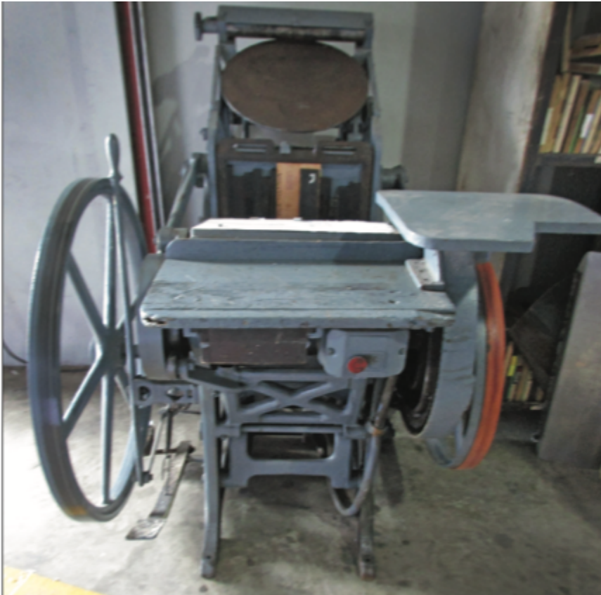
The first printing machine of Karunaratne and Sons bought in 1970.