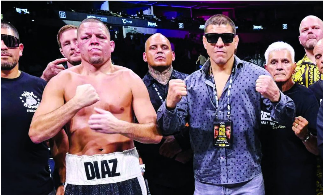
Nick & Nate Diaz