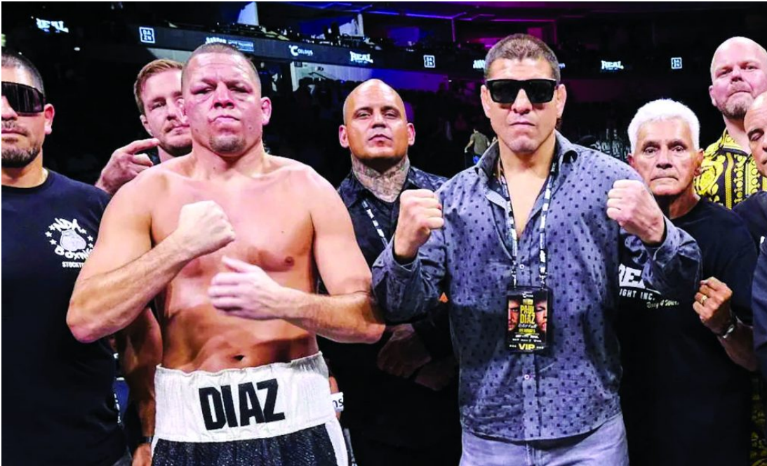
Nick & Nate Diaz