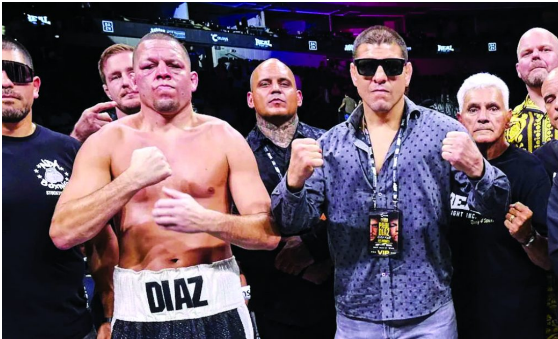
Nick & Nate Diaz