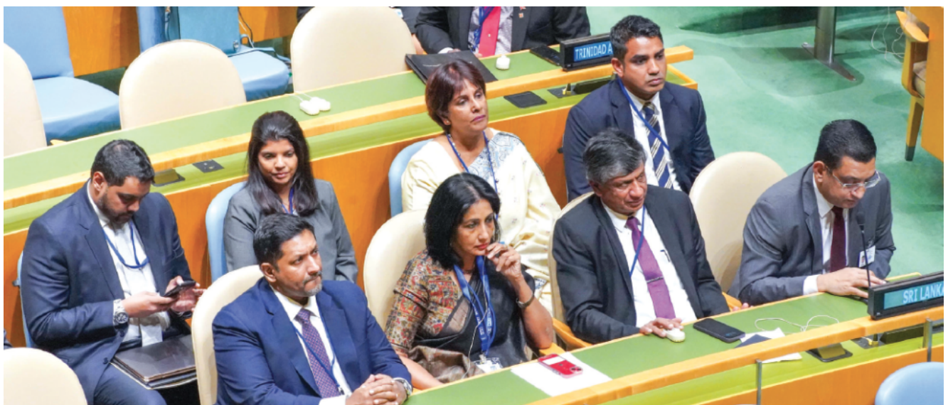
Delegates from Sri Lanka at the UN General Assembly.