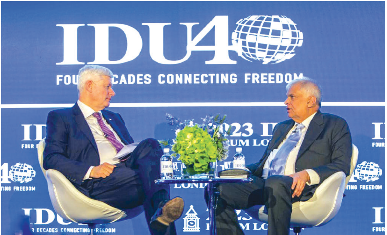
President Ranil Wickremesinghe spoke on his path to Presidency and the steps to economic recovery.