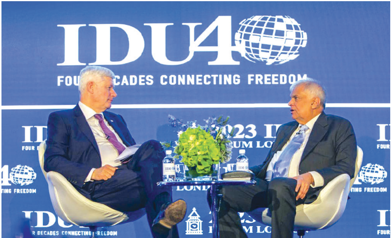
President Ranil Wickremesinghe spoke on his path to Presidency and the steps to economic recovery.