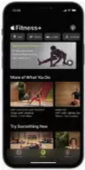
The browse experience in Apple Fitness+ makes getting started with a great workout quick and simple.