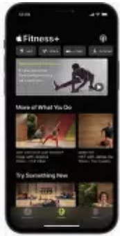
The browse experience in Apple Fitness+ makes getting started with a great workout quick and simple.