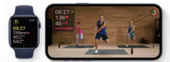
Apple Fitness+, the first fitness experience built around Apple Watch.

Work out any time, anywhere, with the first fitness experience built around Apple Watch.