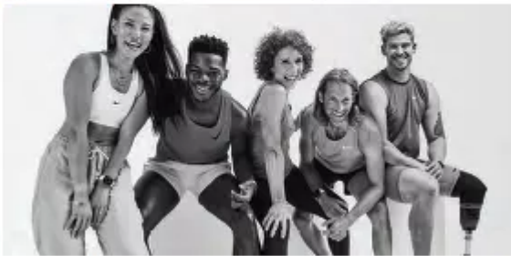
The Fitness+ trainers are a diverse, inclusive, and approachable team made up of people with their own unique and inspiring story.

Apple Fitness+, the first fitness experience built around Apple Watch, bringing inclusive and welcoming studio-style workouts to iPhone, iPad, and Apple TV so users can work out anytime, anywhere. Fitness+ intelligently and seamlessly incorporates key workout metrics users love from Apple Watch directly to iPhone, iPad, and Apple TV alongside inspiring workout content for an unparalleled, highly personalized, immersive experience, set to motivating music from the world's top artists. Whether users are looking for a daily routine, want to try something new, know what they like to do, or are just getting started, Fitness+ offers workouts for everyone from a team of celebrated, charismatic, and passionate trainers who are specialists in their fields, and are inspired to coach all levels, from beginners to fitness enthusiasts.