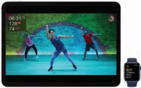
Apple Fitness+ intelligently incorporates workout metrics from Apple Watch for a first-of-its-kind personalized and immersive workout experience.