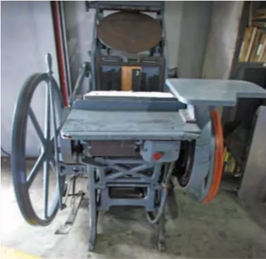
The first printing machine of Karunaratne and Sons bought in 1970.