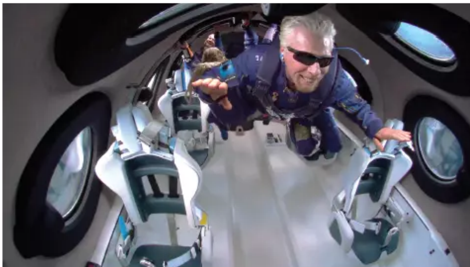
Richard Branson in space.