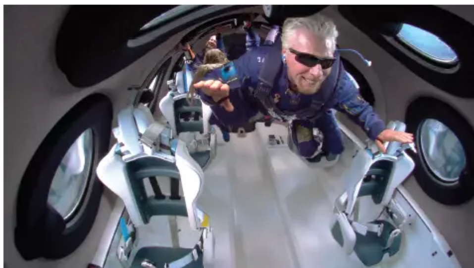
Richard Branson in space.