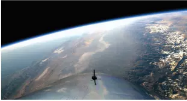
View from Space on Virgin Galactic's First Spaceflight.

VSS Unity achieved a speed of Mach 3 after being released from the mothership, VMS Eve. The vehicle reached space, at an altitude of 53.5 miles, before gliding smoothly to a runway landing at Spaceport America.