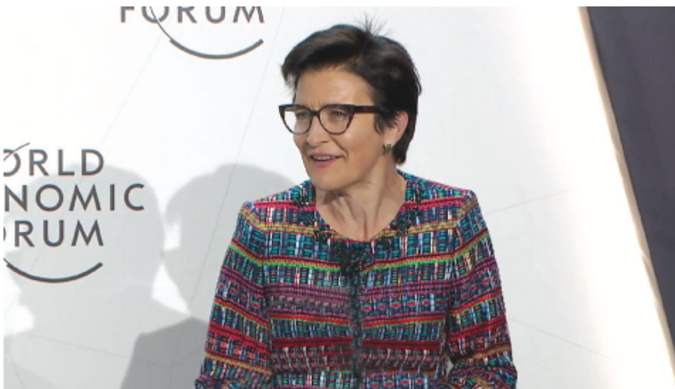
Jane Fraser, CEO, Citi Group.