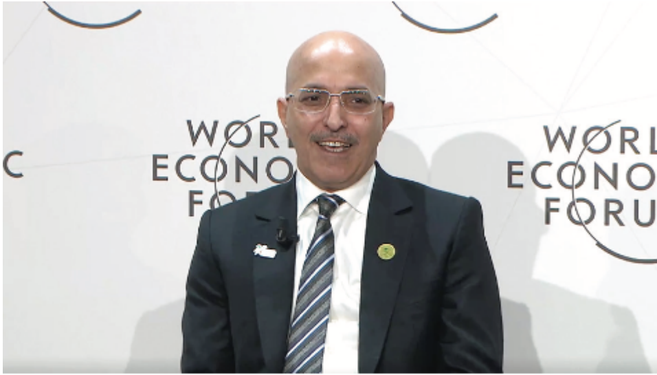
Mohammed Al-Jadaan, Minister of Finance of Saudi Arabia.