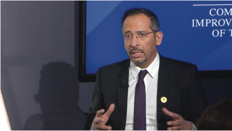
Bandar Alkhorayef, Minister of Industry and Mineral Resources, Ministry of Industry and Mineral Resources of Saudi Arabia.