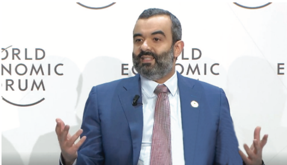
Abdullah AlSwaha, Minister of Communications and Information Technology, Ministry of Communications and Information Technology of Saudi Arabia.