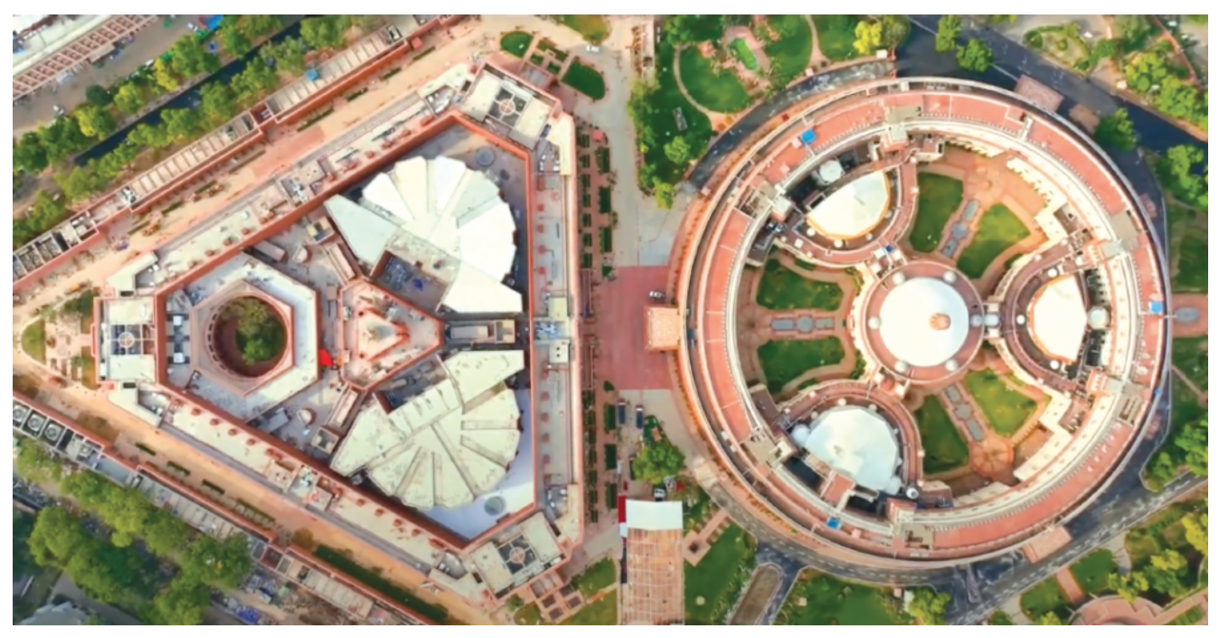
Aerial view of the new Parliament, New Delhi.