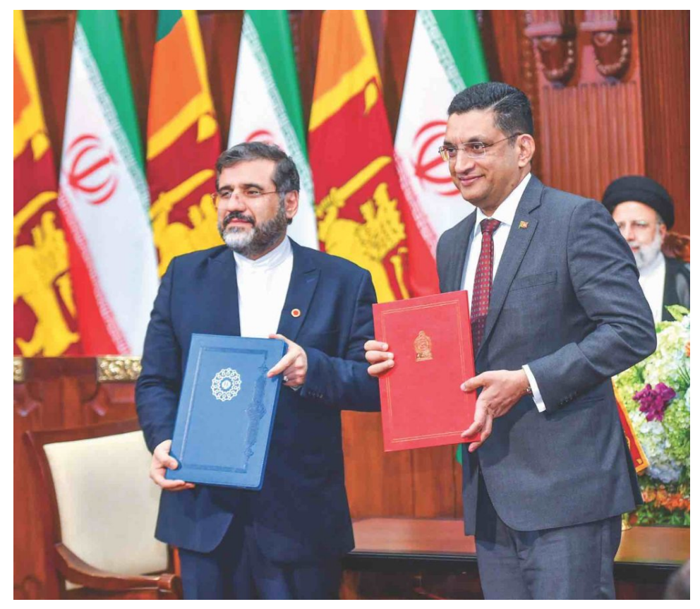
Ali Sabri PC, Foreign Minister (right) with Mohammad Mehdi Esmaeili, Iran Minister of Cultural Affairs (left).

Bandula Gunawardena, Minister of Transport, Highways, and Mass Media (right) signing the MoU with Ali Akbar Mehra Biyan, Iran's Minister of Energy (left).