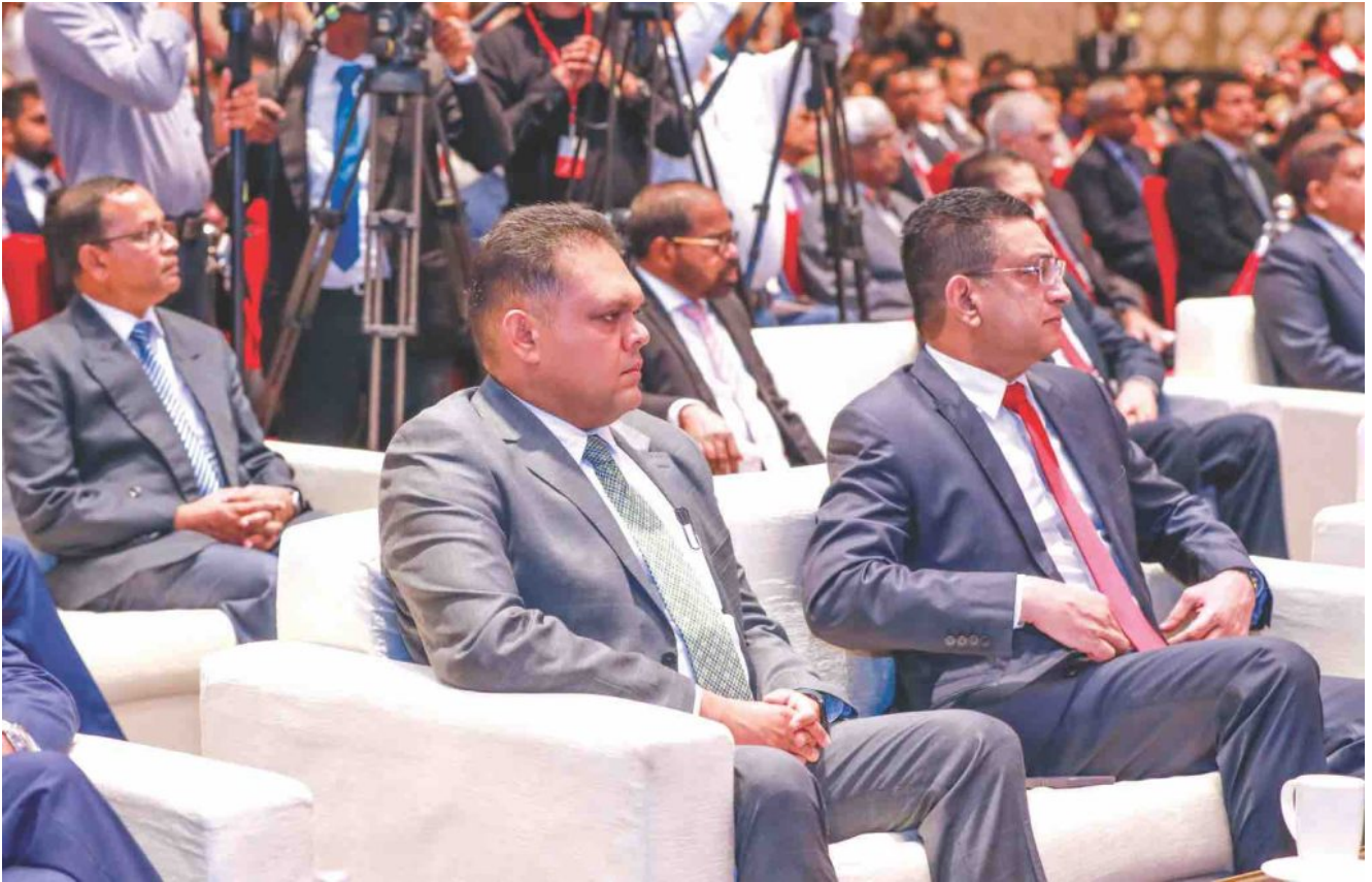
Shehan Semasinghe, State Minister of Finance and Ali Sabry, Minister of Foreign Affairs of Sri Lanka.