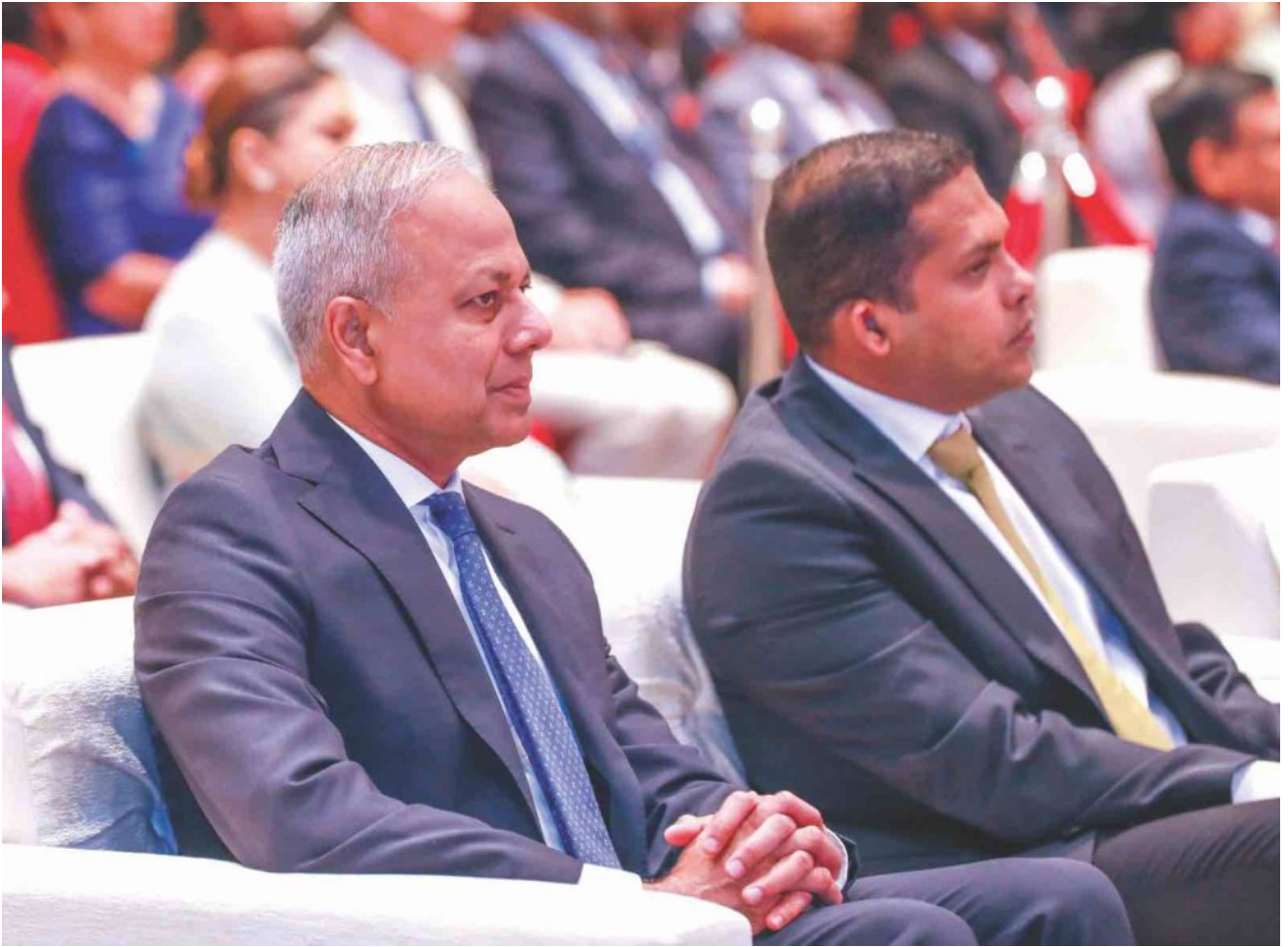
Sagala Ratnayake, Senior Advisor to the President on National Security and Chief of the Presidential Staff and Harin Fernando, Minister of Sports and Youth Affairs of Sri Lanka.