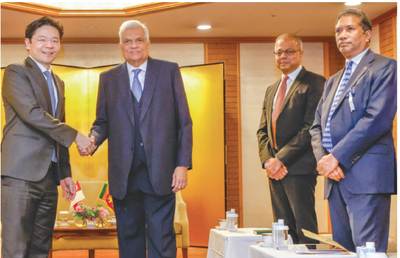
President Ranil Wickremesinghe and Singapore's Deputy Prime Minister Lawrence Wong.