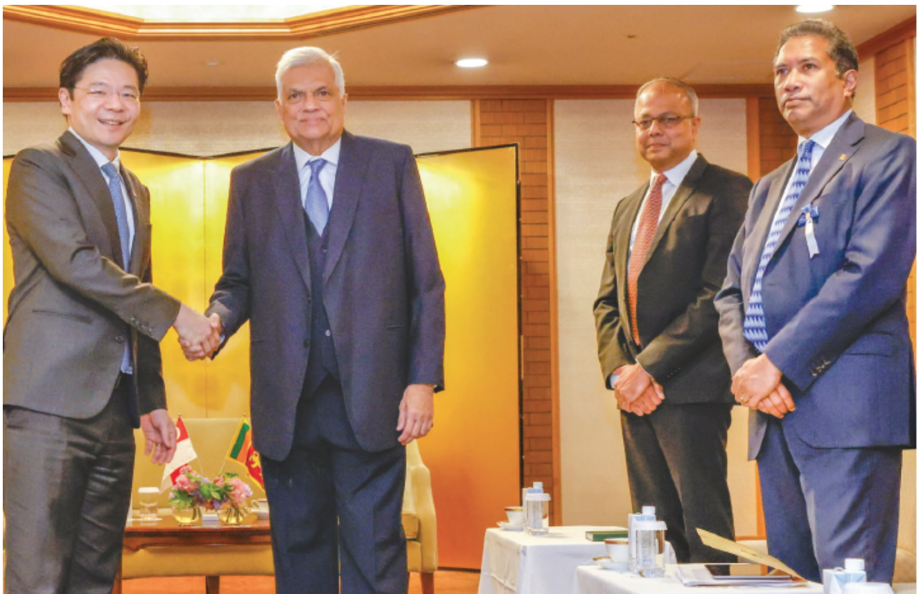
President Ranil Wickremesinghe and Singapore's Deputy Prime Minister Lawrence Wong.