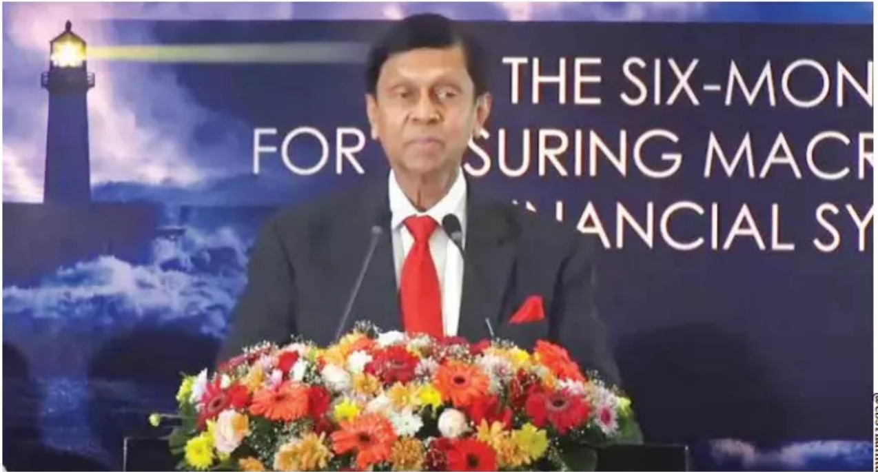
Ajith Nivard Cabraal, Governor, Central Bank of Sri Lanka (CBSL).

The country opened up to another 'new normal' after an extended lockdown to tackle a severe surge of COVID-19 that resulted in an unprecedented number of casualties. The government is staring right in the face of an economy in peril. Intermittent regulations and rules to mitigate anticipated downturns have only added to the apprehension and uncertainty among the people and the business community. In this background, the Central Bank of Sri Lanka (CBSL), being led again by its alumnus Ajith Nivard Cabraal is planning to steer the country's economy through a six-month road map to focus on the critical issues threatening the economy with a to-do list.