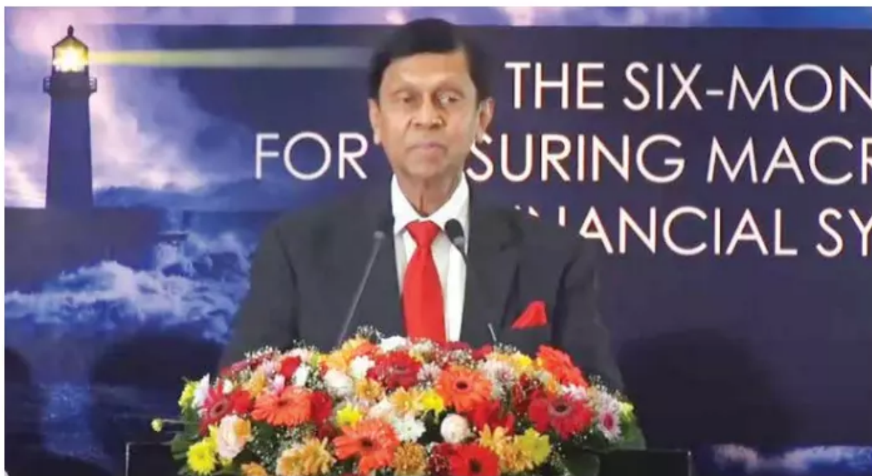
Ajith Nivard Cabraal, Governor, Central Bank of Sri Lanka (CBSL).

The country opened up to another 'new normal' after an extended lockdown to tackle a severe surge of COVID-19 that resulted in an unprecedented number of casualties. The government is staring right in the face of an economy in peril. Intermittent regulations and rules to mitigate anticipated downturns have only added to the apprehension and uncertainty among the people and the business community. In this background, the Central Bank of Sri Lanka (CBSL), being led again by its alumnus Ajith Nivard Cabraal is planning to steer the country's economy through a six-month road map to focus on the critical issues threatening the economy with a to-do list.