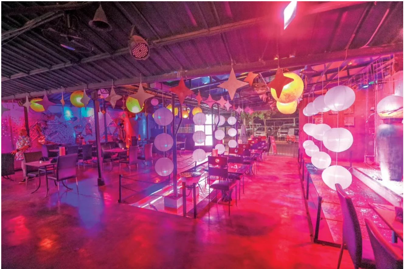
Batsman Restaurant with a quiet and romantic ambiance.