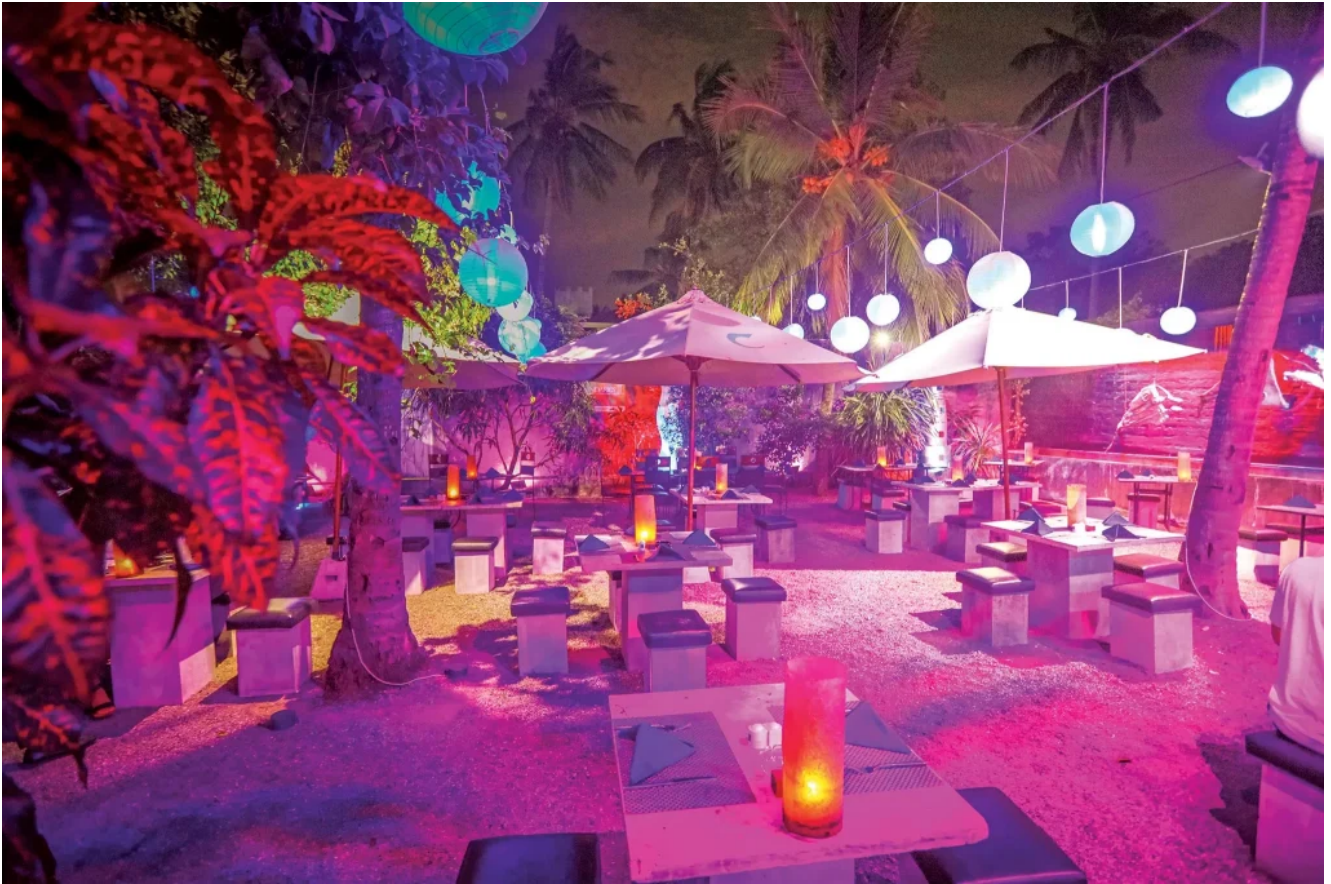
Dine under the stars at the Outdoor Boundaries Garden Restaurant and Bar.