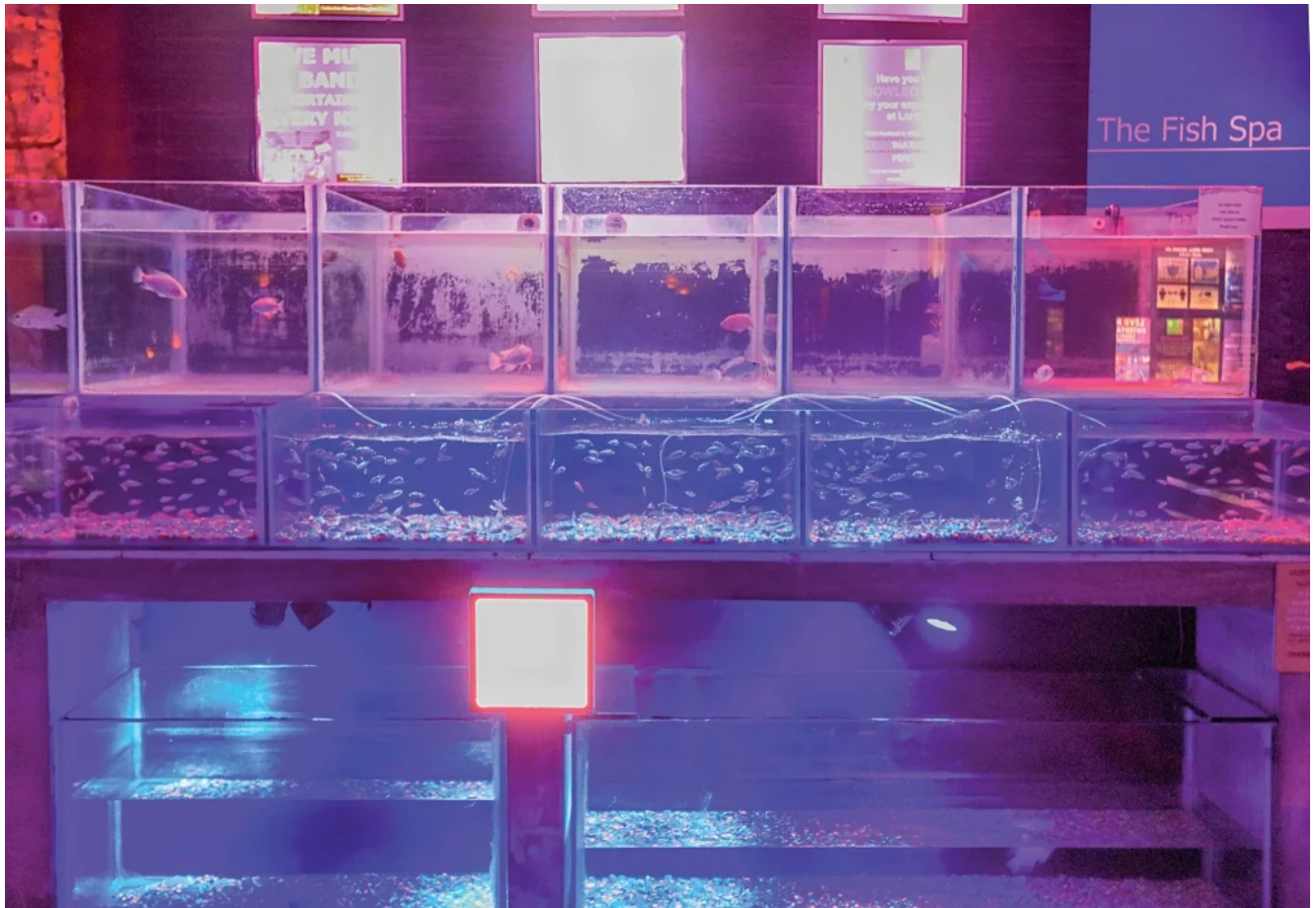
The Fish Spa section.