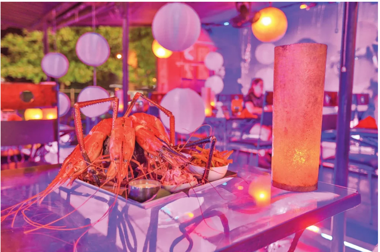
Dig into some mouthwatering seafood.