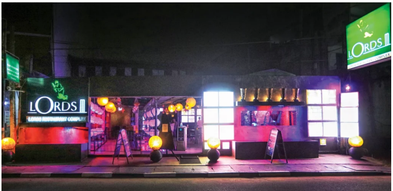
Lords, Negombo is all set up in full swing to serve its patrons again.