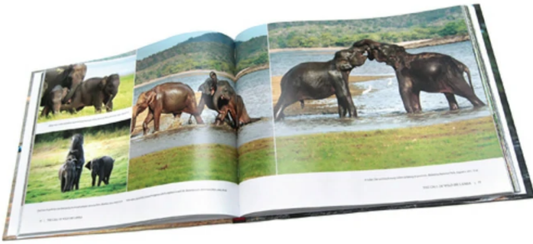
4.1 THE LIFE OF ELEPHANTS