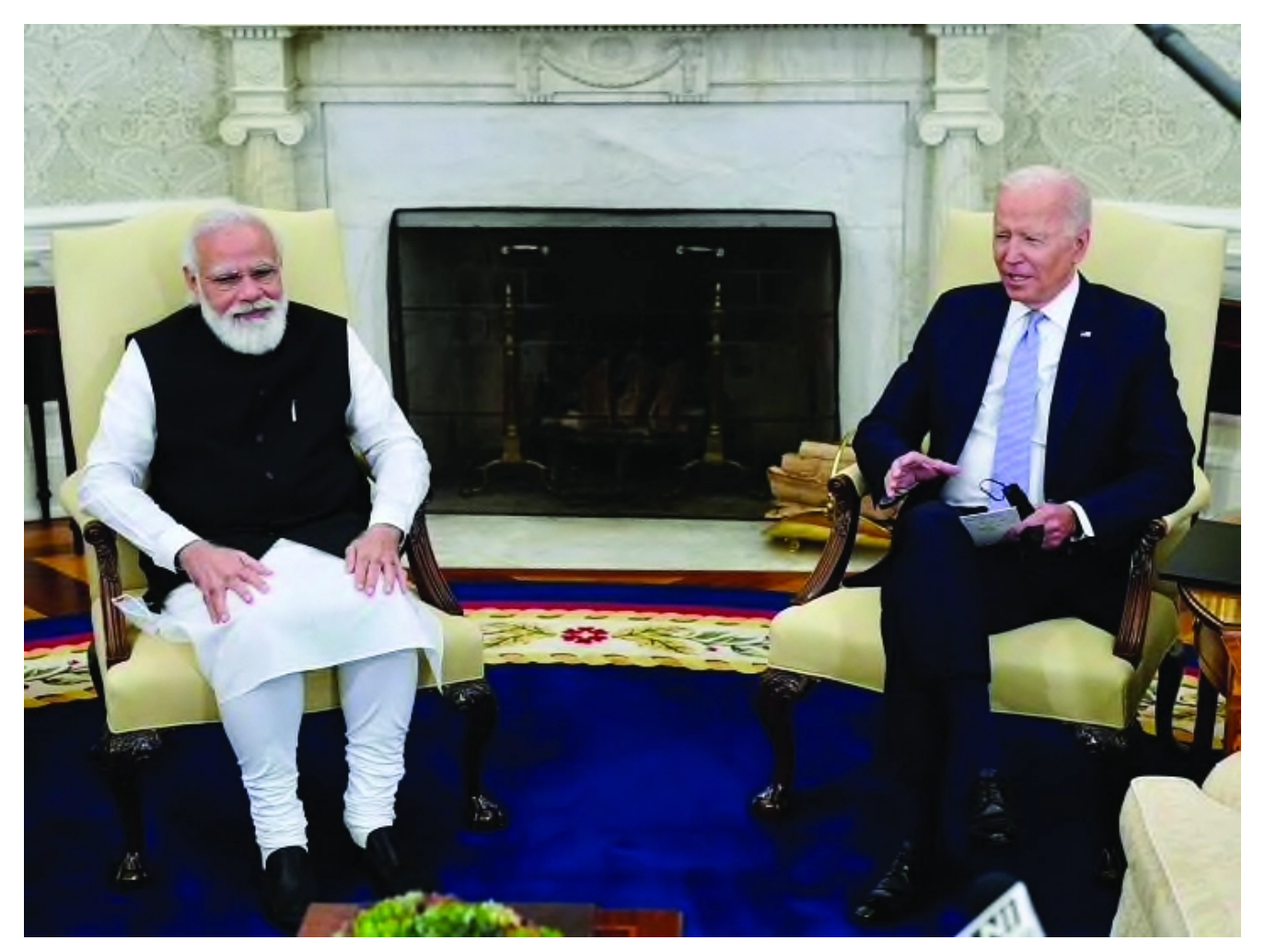
Prime Minister Narendra Modi and President Joe Biden.

President Joe Biden and Prime Minister of India Narendra Modi met at the White House.