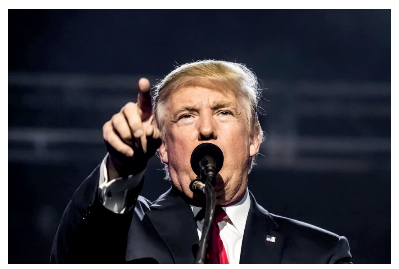
President of the United States Donald Trump.

While Bitcoin (BTC) attempted a breakout already as Americans were casting their ballots, the true rally came once President-Elect Donald Trump's lead in the electoral college started becoming overwhelming.