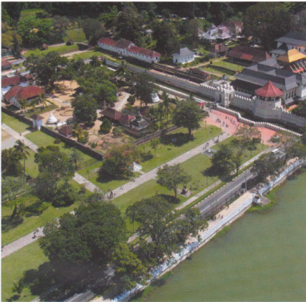
Bird's eye view of Kandy from "Small Island - Big Trip"