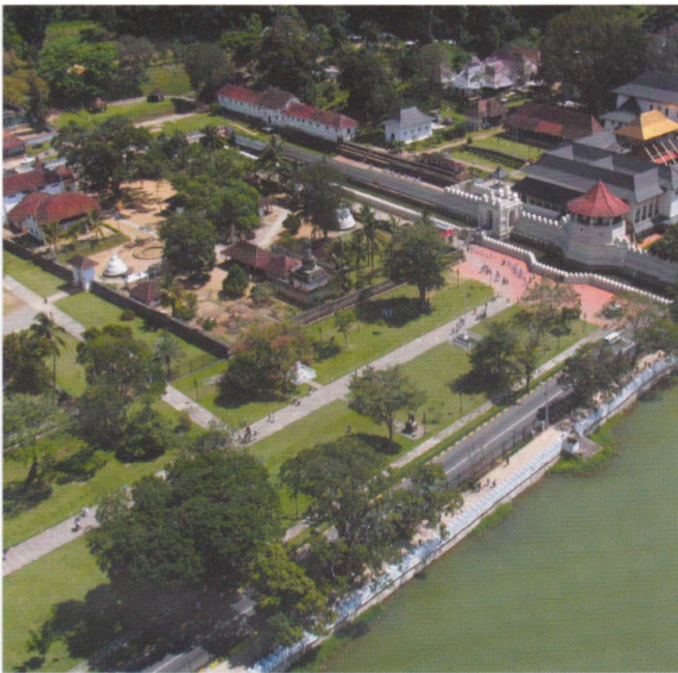
Bird's eye view of Kandy from "Small Island - Big Trip"