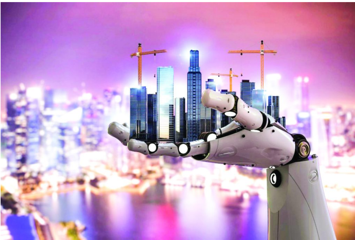
The future of AI-Driven economies.