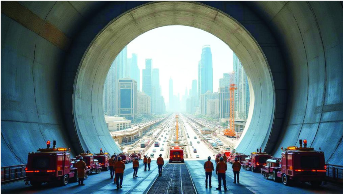
Boring Company to build Dubai Loop, a revolutionary tunnel system to transform urban mobility.