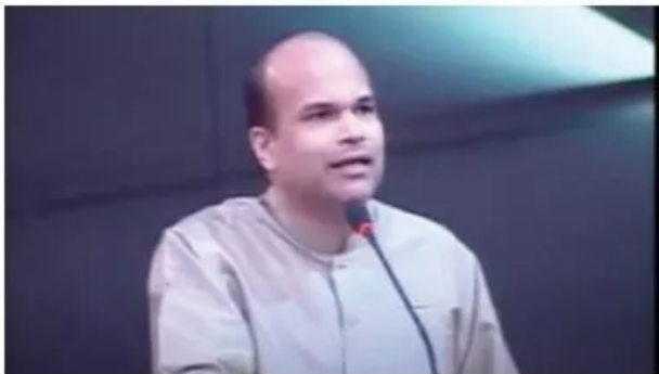
Milinda Moragoda addressing the gathering at the 'Vibrant Gujarat' Investors Forum, 2009.

The issue of externally displaced persons living in India having fled Sri Lanka at various times, some nearly three decades ago, while others during the height of the war in the 2000s, has been a thorn in the relations between the two countries. Although the UNHCR has been facilitating voluntary repatriation, various factors have been impeding the process. It's a timely consideration that will require a great deal of diplomacy and dexterousness in mediation that the high commissioner-designate has added to his repertoire of duties. He proposes through a multipronged approach of preparing a comprehensive resettlement plan by the Government of Sri Lanka and formally conveyed to the Ministry of External Affairs of India to engage with the UNHCR and other stakeholders after positive feedback from the Ministry of External Affairs of India. In this exercise, positive engagement with the political leadership of Tamil Nadu to encourage and facilitate a smooth return of the EDPs is of paramount importance.