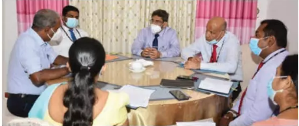
BOC officials in discussion.