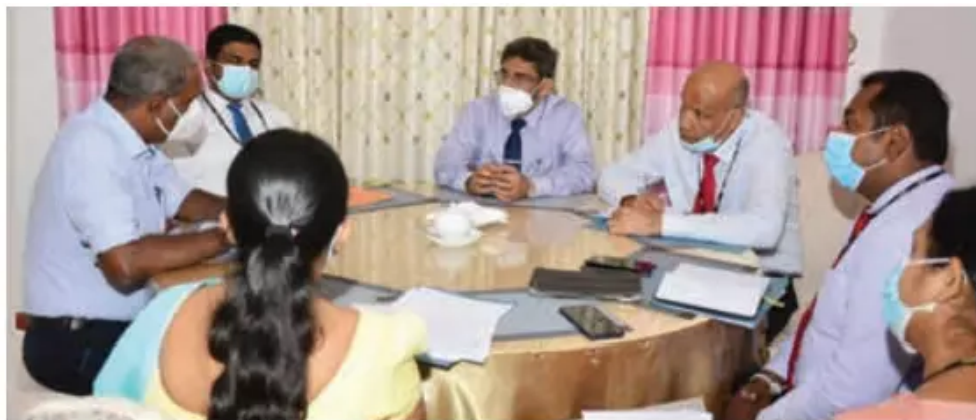
BOC officials in discussion.