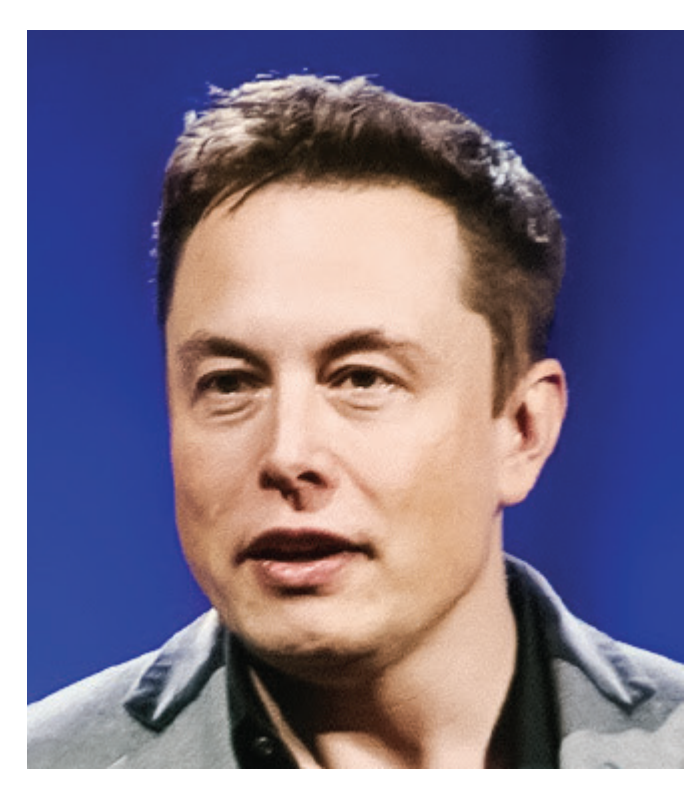
Jeff Bezos - The Former Rival

million to Trump's campaign and was tapped to lead the newly proposed Department of Government Efficiency. His appearance underscored his desire to extend his transformative thinking beyond business into public administration.