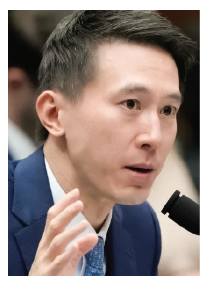
A Billionaire Affair

This historic inauguration was more than just a celebration of Trump's presidency; it was a vivid display of how wealth and influence can shape political and economic strategies. The billionaires in attendance brought diverse expertise—from technology and luxury to energy and entertainment—demonstrating the profound ways in which their industries intersect with governance. Together, they represented not just immense wealth but the future of innovation and global cooperation.