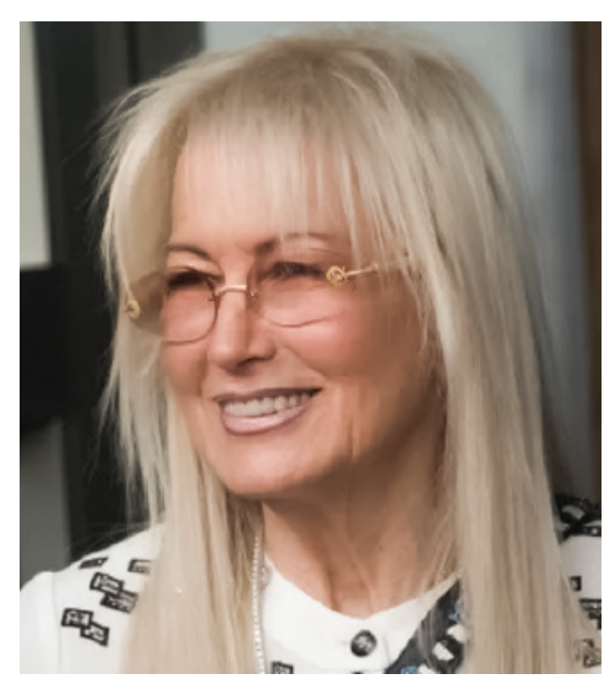
Shou Zi Chew - The Global Connector

significant Republican donors. With a personal fortune of USD 34 billion, her attendance demonstrated the enduring role of high-net-worth individuals in shaping Republican policy and campaigns.