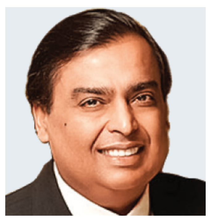
The Political Allies