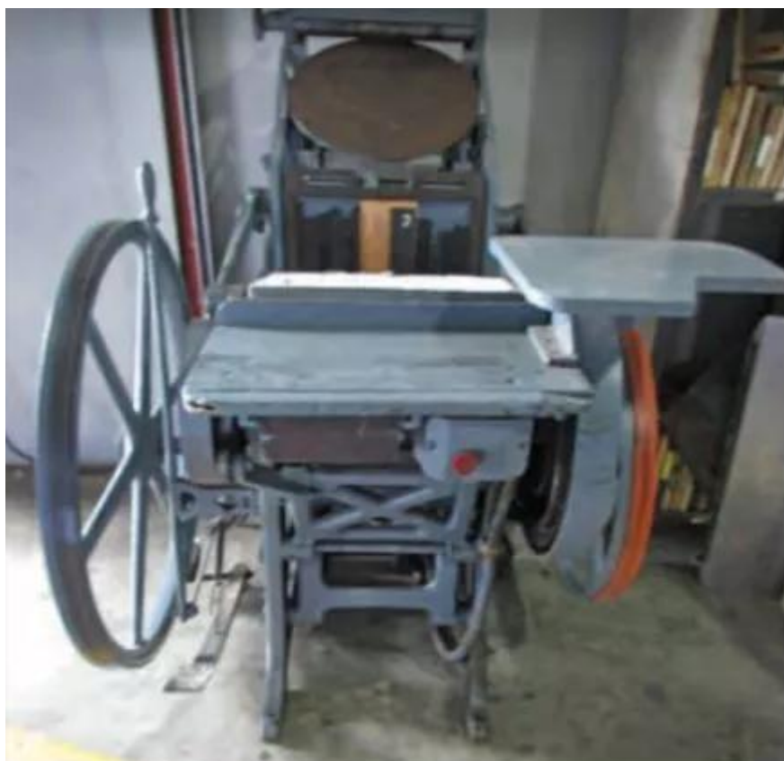
The first printing machine of Karunaratne and Sons bought in 1970.