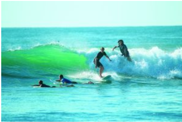
Surfers catching waves at Arugambay.

Wildlife Tourism: Wildlife encounters are another strong draw, as travelers look for authentic experiences that allow them to observe and learn about animals in their natural habitats. This trend reflects the growing awareness of wildlife conservation and responsible tourism practices. Destinations in Africa for safaris, Australia's Great Barrier Reef, and South America's rainforests are popular choices, attracting visitors who want to immerse themselves in nature and see rare species up close.