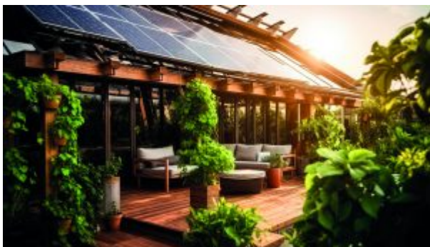
An eco-friendly hotel surrounded by lush nature, with solar panels and visible sustainability features.

With surfing and wildlife tourism on the rise, destinations that promote these activities in a sustainable, respectful manner are seeing increased interest. Tourists today are not only seeking adventure but also looking for experiences that offer a sense of purpose, whether that's through catching waves or contributing to wildlife conservation. As OTAs and channel managers further promote these outdoor adventures, destinations embracing surfing and wildlife experiences are well-positioned to attract this growing segment of thrill-seekers and nature enthusiasts.