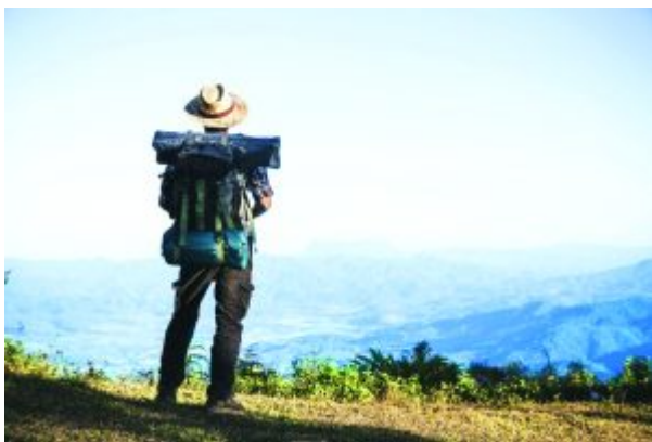
A solo traveler enjoying a break from the digital world.

Insight: OTAs and channel managers now feature “digital detox” and “nature retreat” filters, allowing travelers to select locations that facilitate this disconnect. Providers catering to these preferences are seeing increased interest and bookings from stressed urban dwellers looking to recharge.