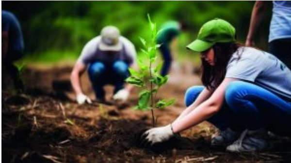
Tourists planting trees in a local community.