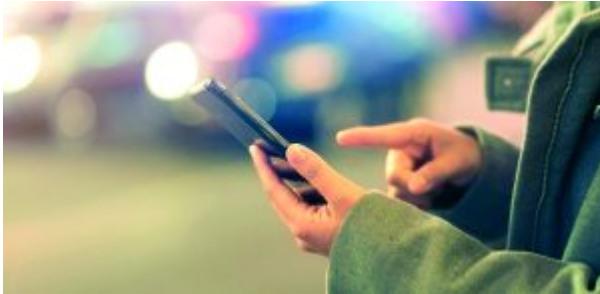
Tourist Priorities When Choosing a Destination (Survey Results)