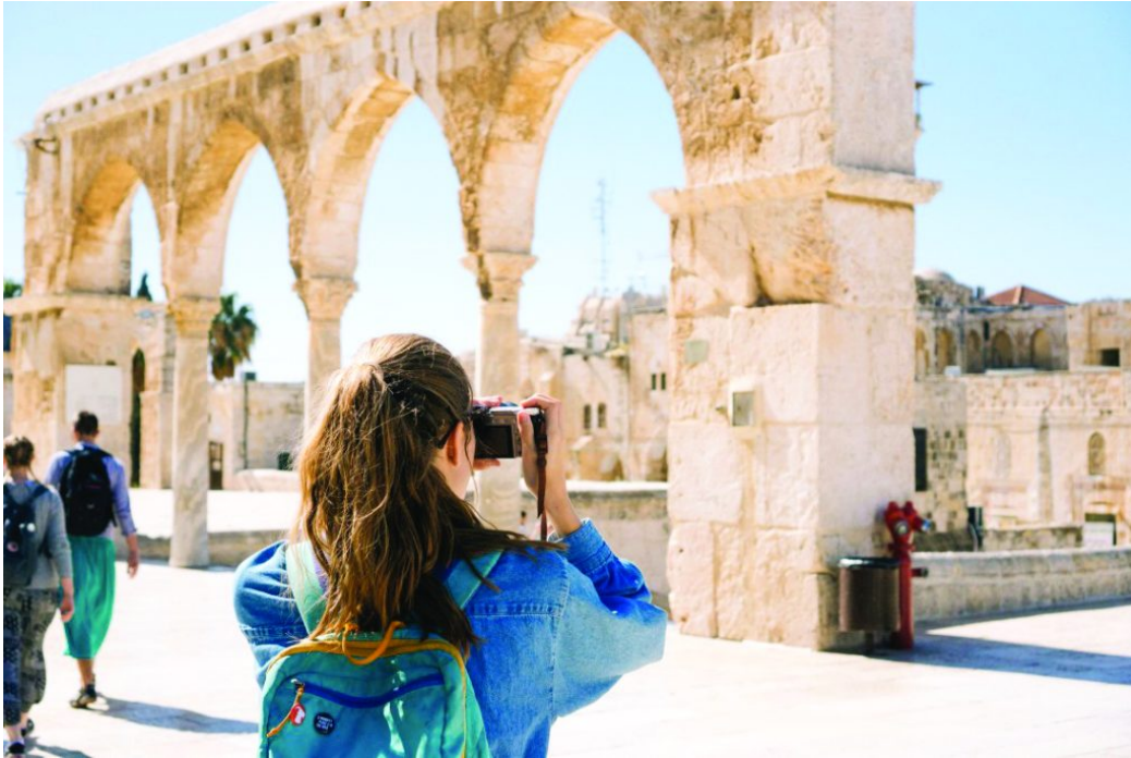
An iconic Instagrammable location with tourists taking photos.