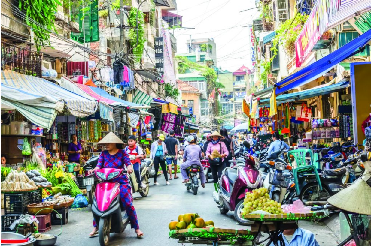
An emerging destination – bustling market in Vietnam.