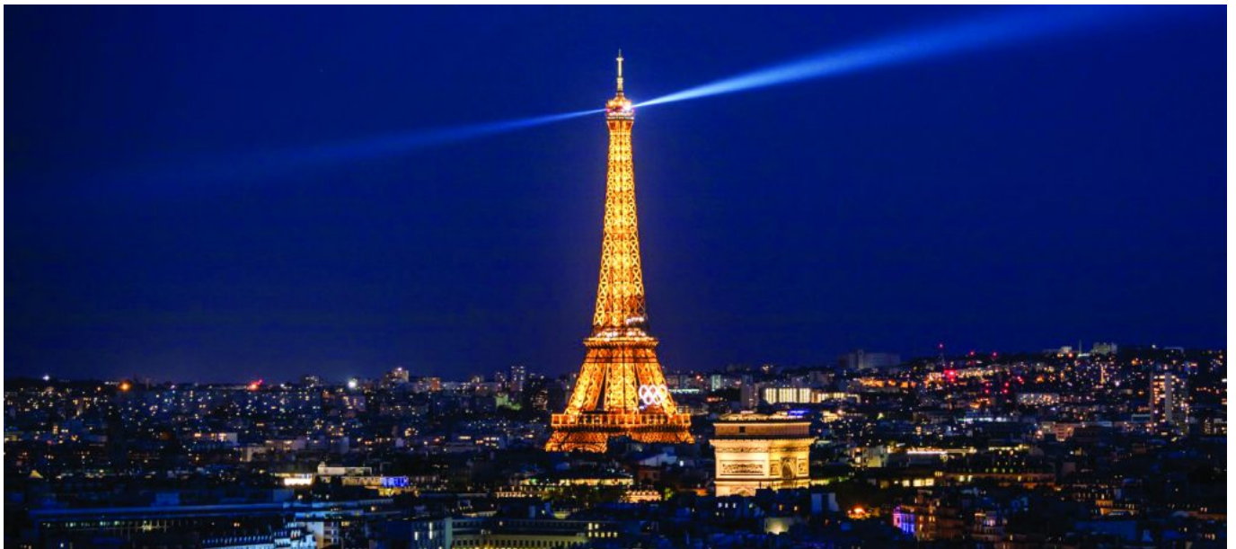
Eiffel Tower, France.