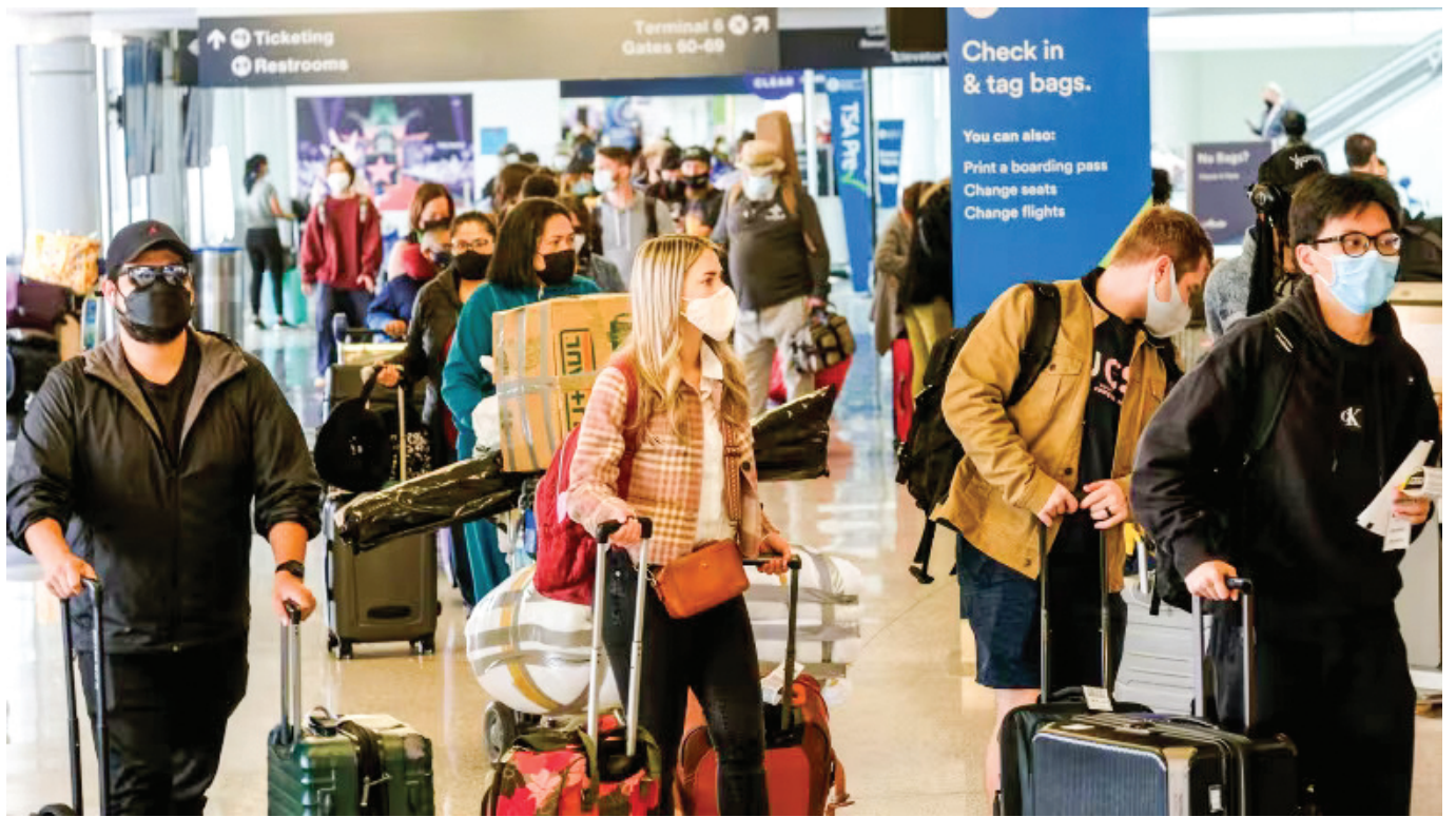
A busy airport with travelers standing in line for check-in, symbolizing the return to travel with safety protocols.