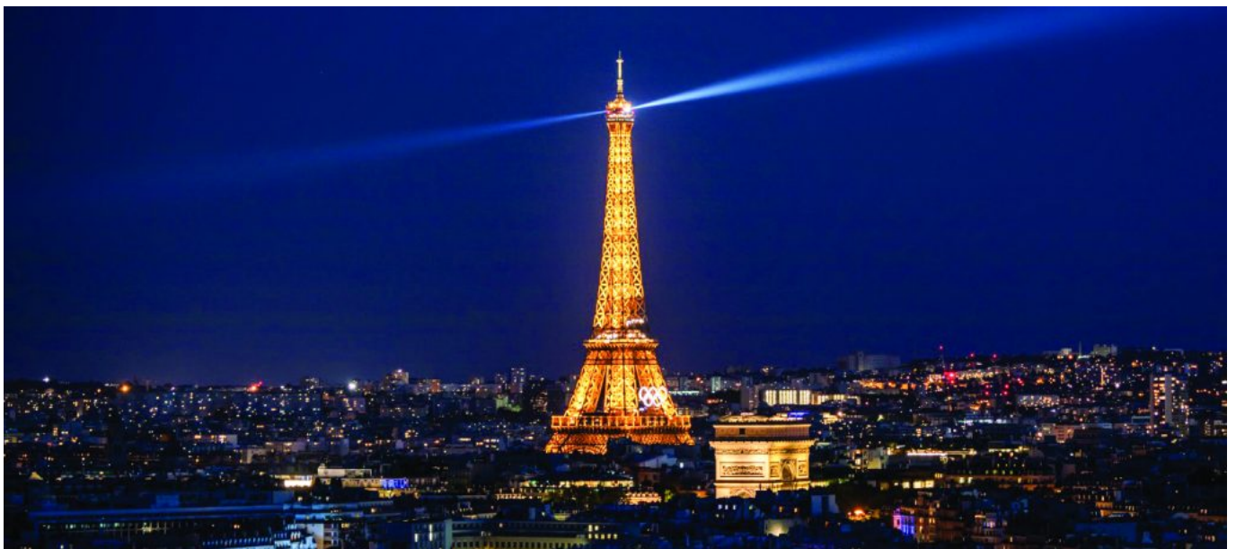
Eiffel Tower, France.