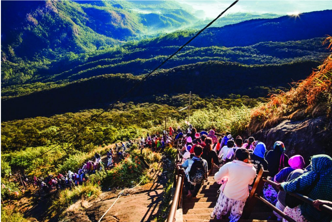
The season attracts many travellers at Sri Pada.