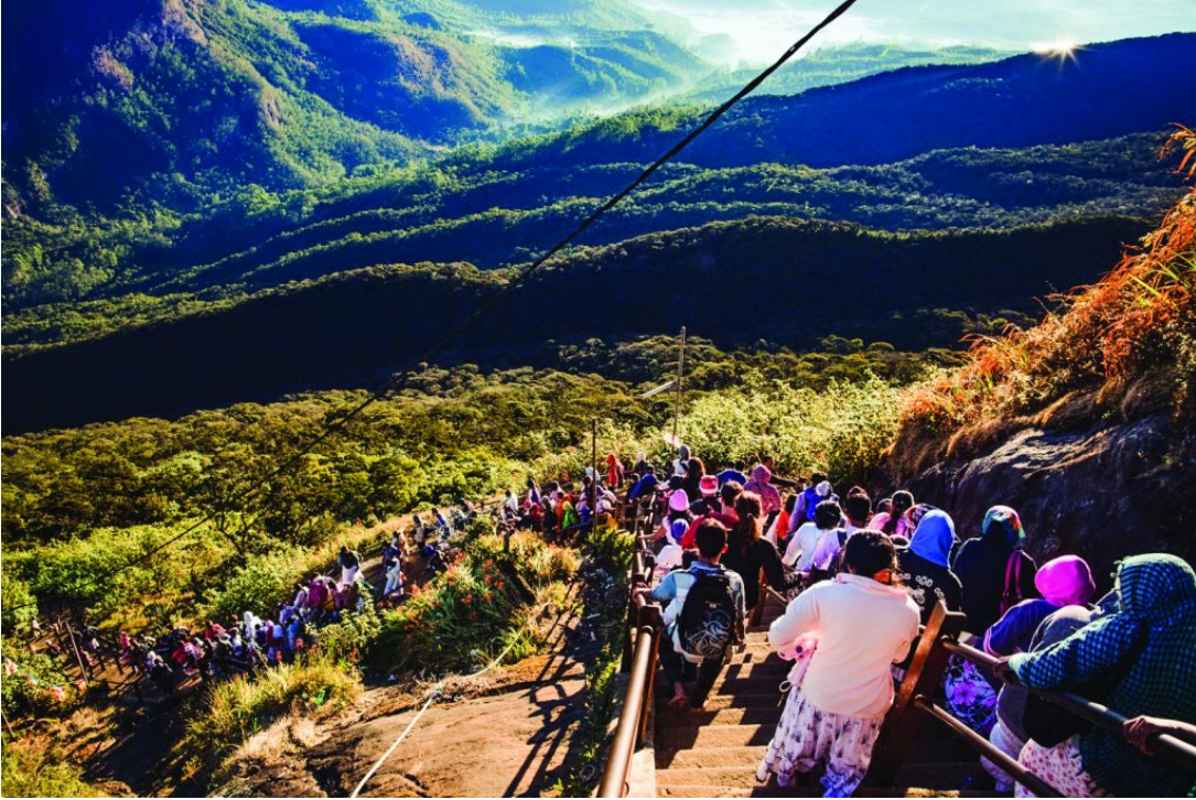
The season attracts many travellers at Sri Pada.