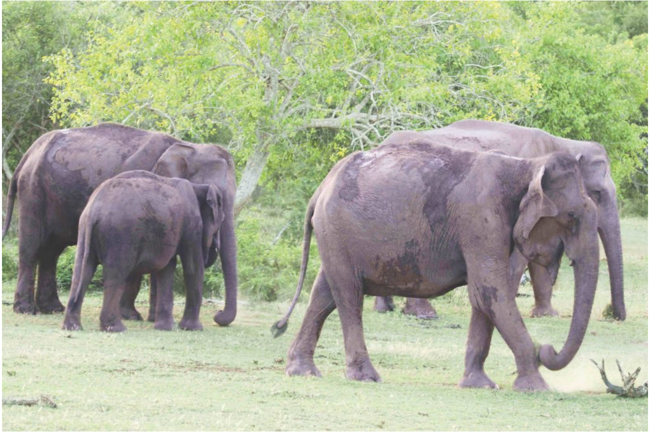
Elephants at Kumana National Park.

Sri Lanka is a rising star in the global tourism market, known for its beautiful beaches, rich culture, historical sites, and wildlife.