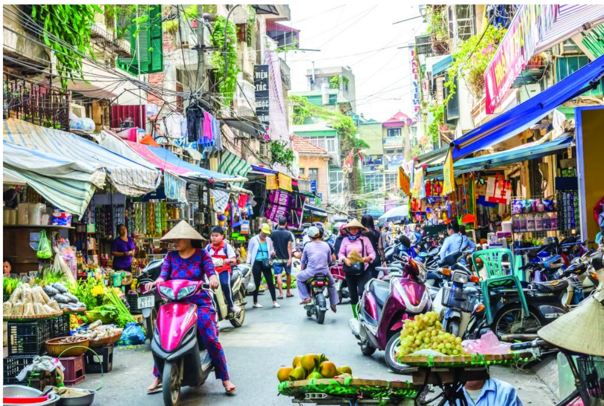
An emerging destination – bustling market in Vietnam.