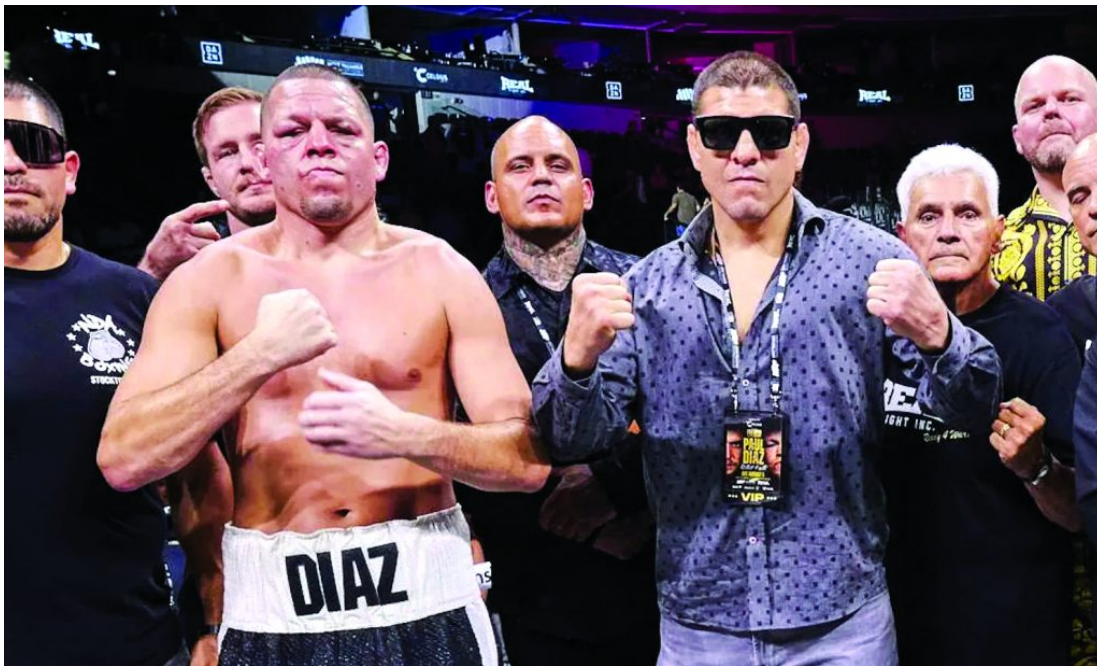
Nick & Nate Diaz

Lion Order is the intersection of Rastafari values, premium Marley-approved cannabis, and admirable business ethics. The brand continues making waves with its many popular strains, from King Clementine to Roadblock. In short, it's Rohan Marley's vision brought to life in an effort to show how business can be used as a force for good.