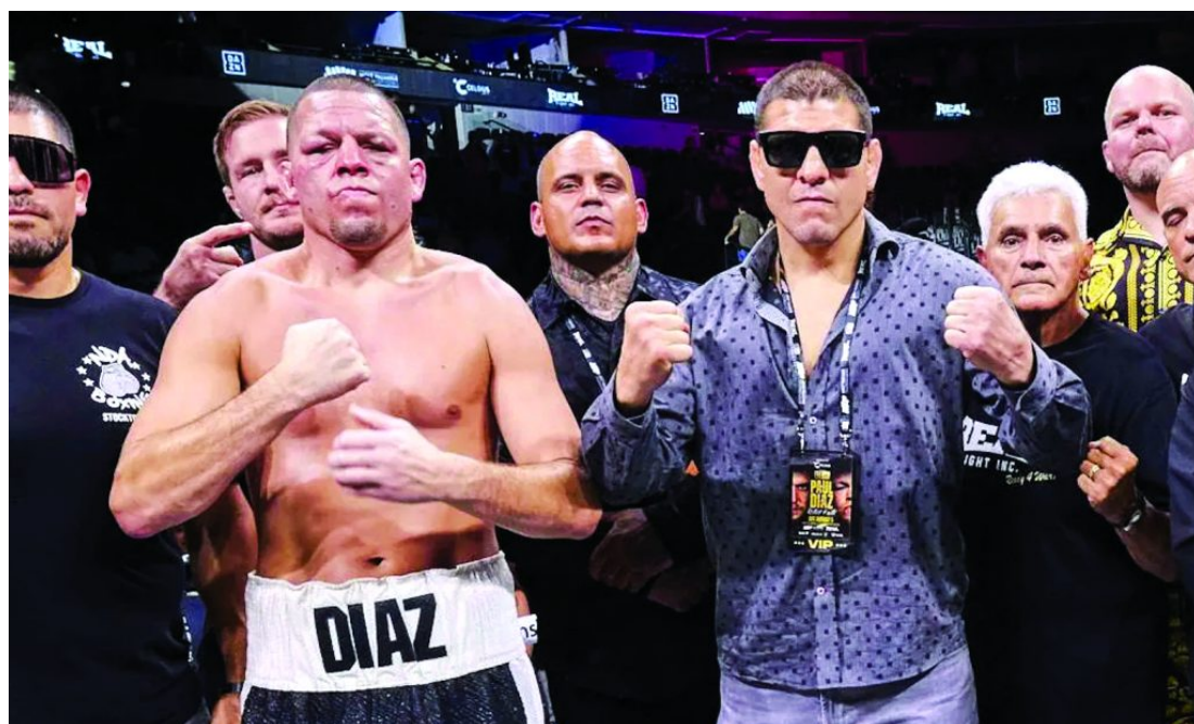
Nick & Nate Diaz

Lion Order is the intersection of Rastafari values, premium Marley-approved cannabis, and admirable business ethics. The brand continues making waves with its many popular strains, from King Clementine to Roadblock. In short, it's Rohan Marley's vision brought to life in an effort to show how business can be used as a force for good.