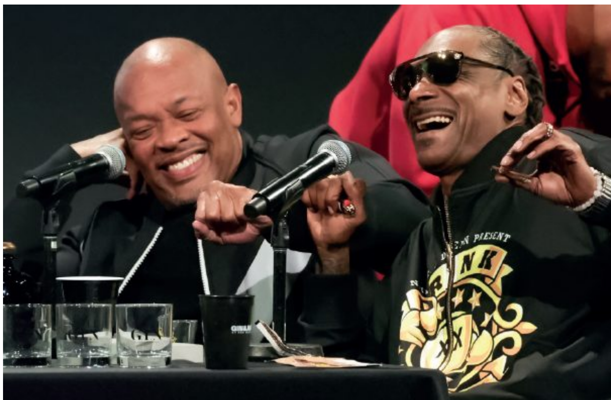
Snoop Dogg and Dr.Dre perform a new song together.