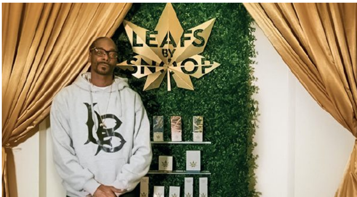
Snoop with his brand Leafs by Snoop.