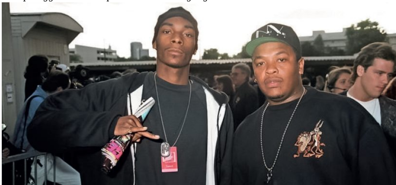
Snoop Dogg and Dr Dre at the 1993 MTV Movie Awards.