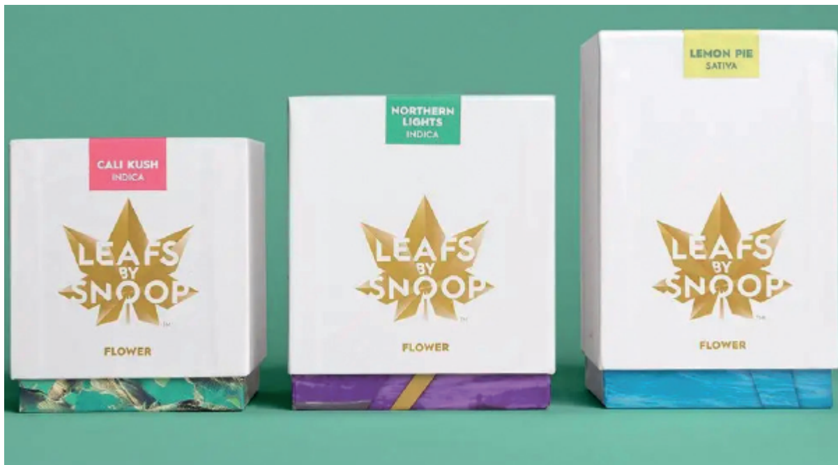
Leafs by Snoop, featuring sleek packaging and branding.

who continues to inspire generations. Whether he's dropping bars, closing deals, or spending time with his family, Snoop does it all with style, grace, and that signature West Coast cool. As Snoop said, "If the ride is more fly, then you must buy." And with a life like his, the ride just keeps getting better. Bow wow wow, yippie yo, yippie yay—the Doggfather reigns supreme.