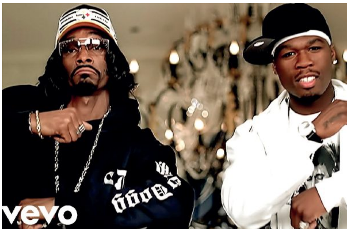
50 Cent performing P.I.M.P. with Snoop Dogg.