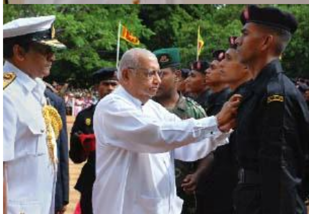
With Prime Minister Ranastri Wickramanayake