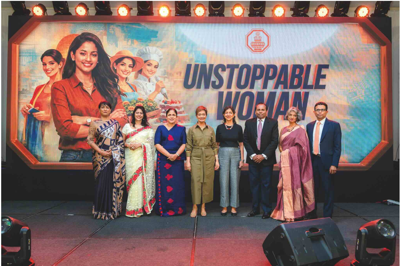
Sampath Bank officials with guest speakers.