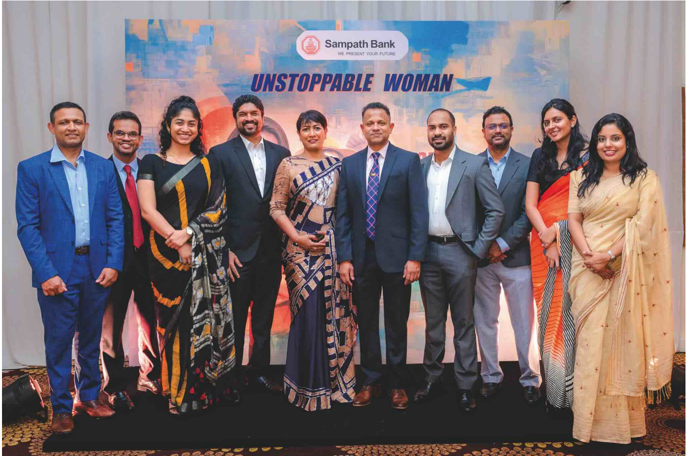
Team Marketing of Sampath Bank.