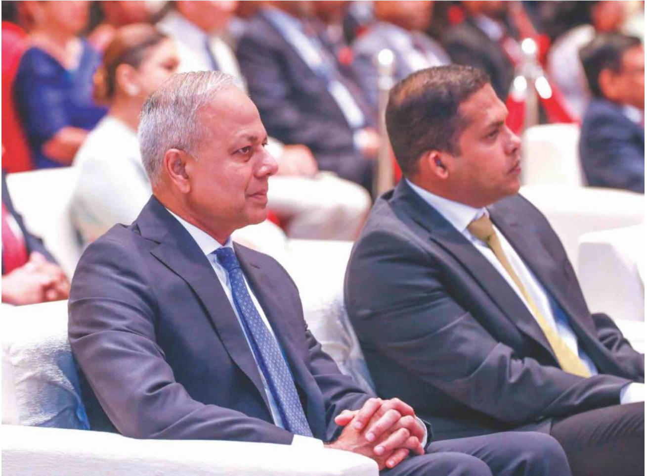
Sagala Ratnayake, Senior Advisor to the President on National Security and Chief of the Presidential Staff and Harin Fernando, Minister of Sports and Youth Affairs of Sri Lanka.