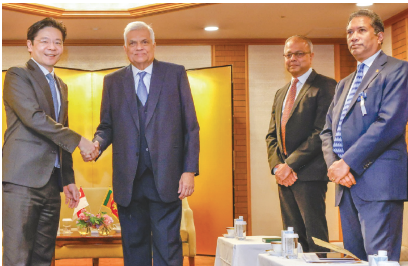
President Ranil Wickremesinghe and Singapore's Deputy Prime Minister Lawrence Wong.