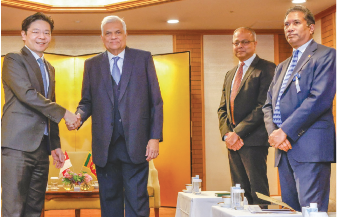
President Ranil Wickremesinghe and Singapore's Deputy Prime Minister Lawrence Wong.