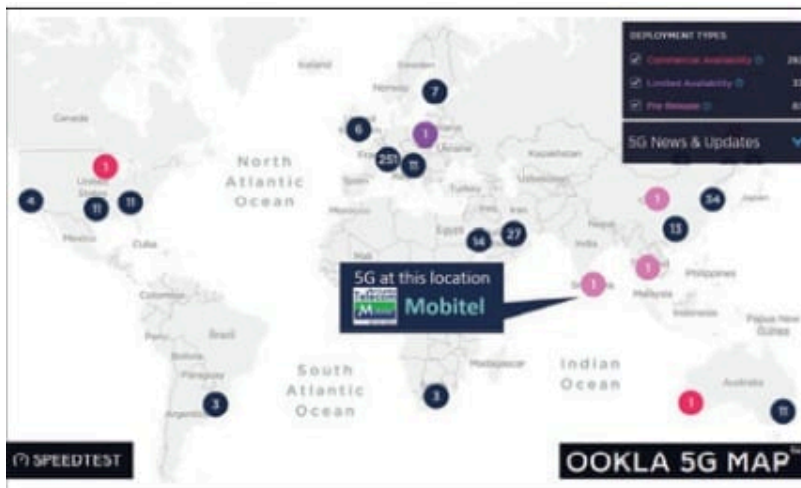
Image of Mobitel's location on the Ookla 5G map.

As a result of mobile 5G speed achievements, Ookla, which carries out speed test benchmarking, recognized Mobitel as the first mobile 5G network in South Asia, which was a proud achievement to all Sri Lankans. These Mobile 5G services were demonstrated using Huawei 5G network equipment in 3.6GHz trial spectrum allocation from the Telecommunications Regulatory Commission of Sri Lanka (TRCSL). The next generation of 5G services will not only provide Giga bit speeds, but also will revolutionize the industries across the globe with inherent ultra-reliable and low latency capabilities of 5G technology