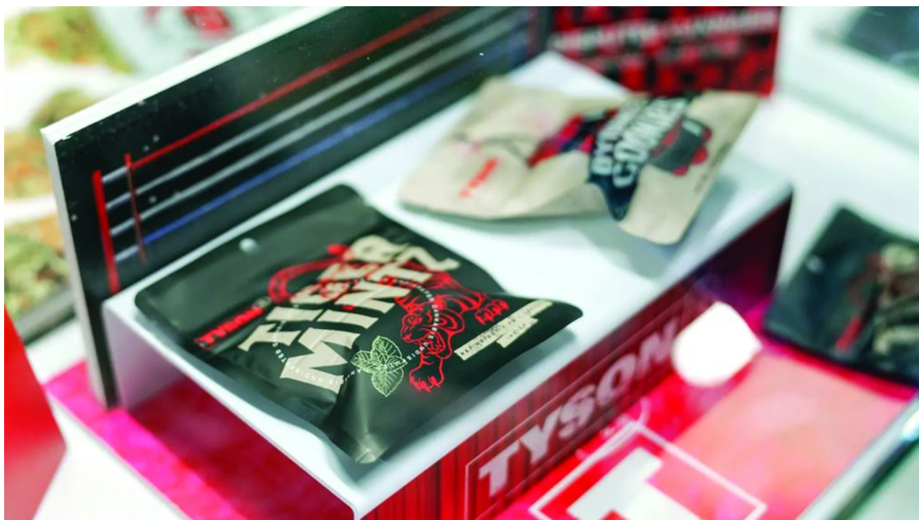
Mike Tyson's Tyson 2.0 cannabis products (Tyson 2.0).