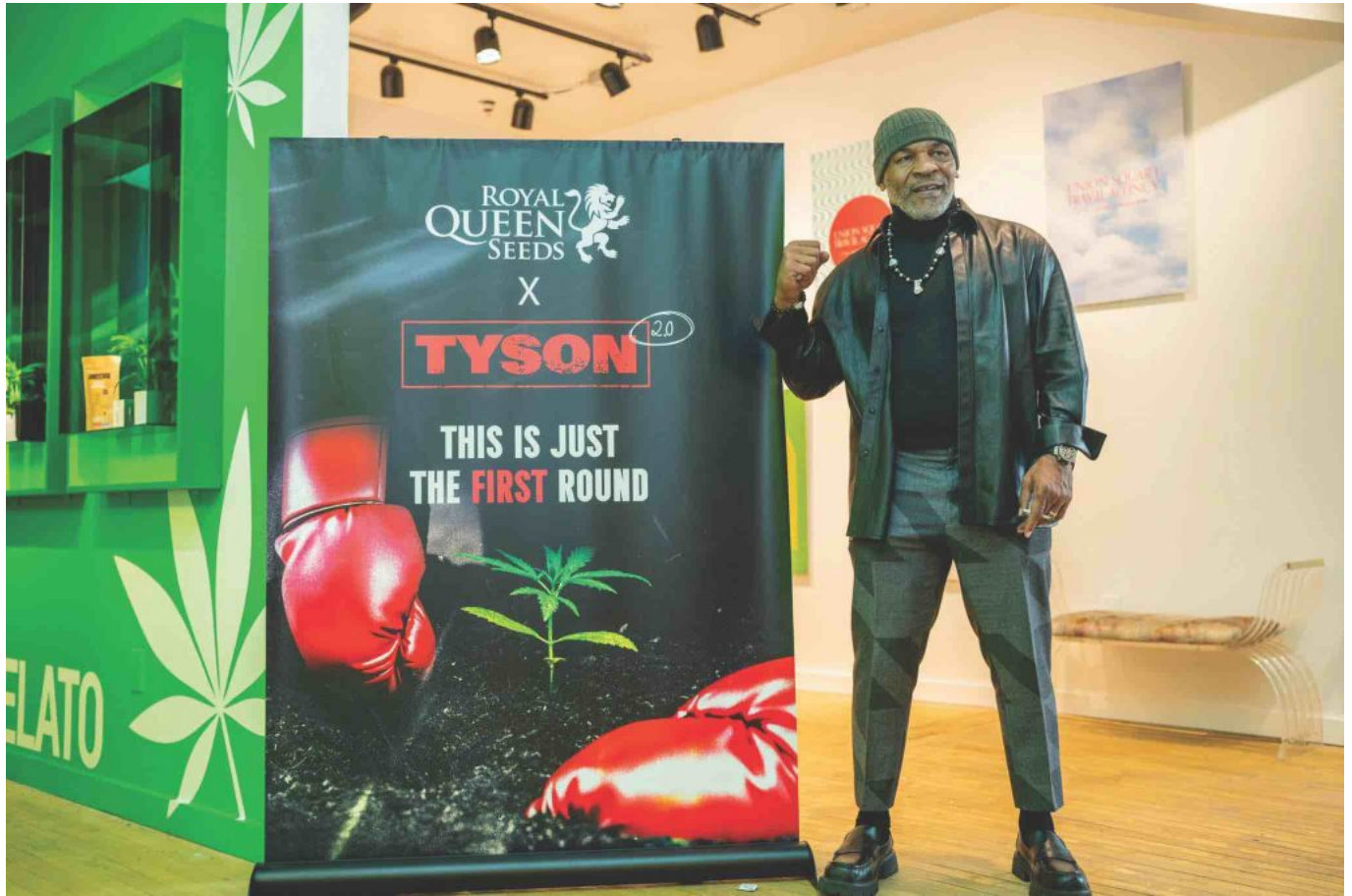
TYSON 2.0 dominated the official launch in NYC.