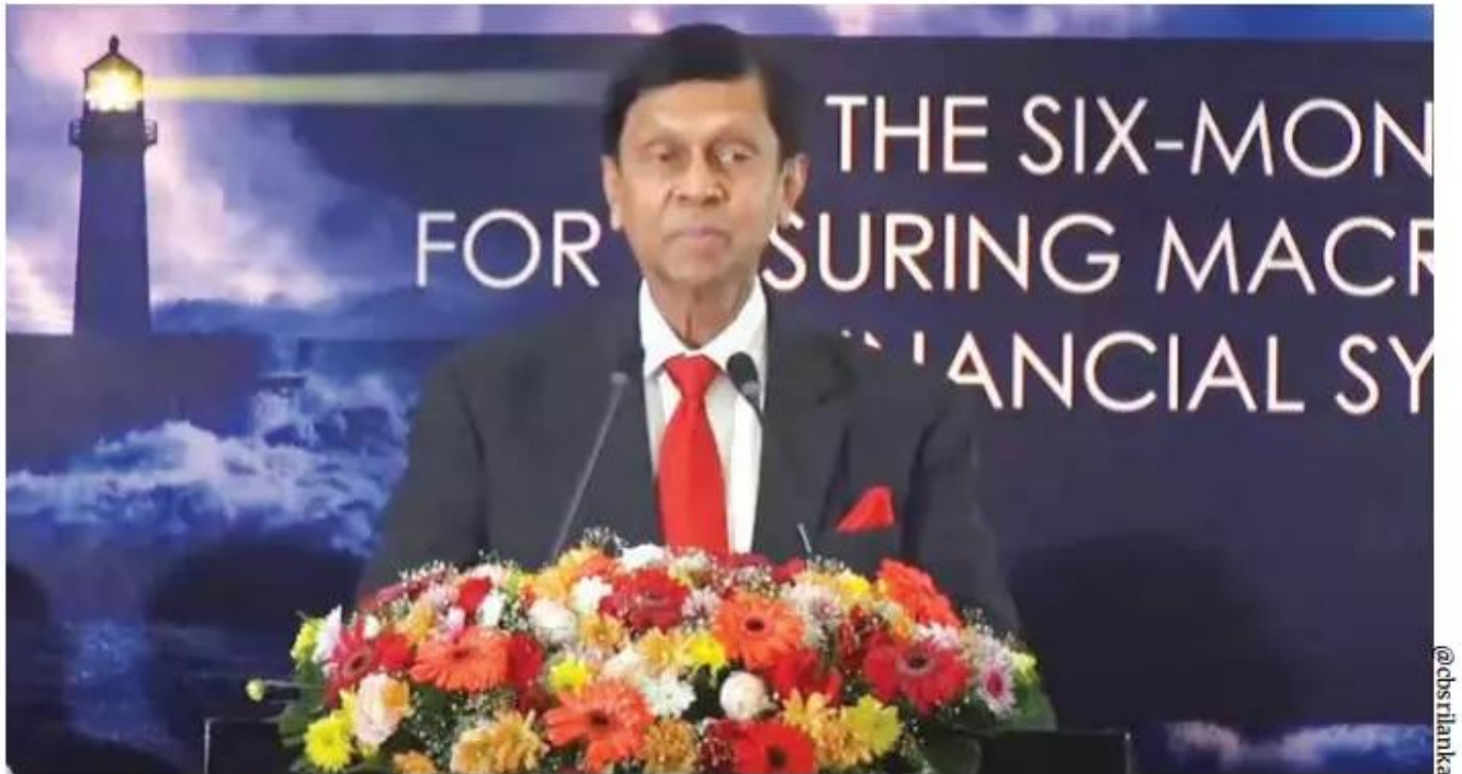
Ajith Nivard Cabraal, Governor, Central Bank of Sri Lanka (CBSL).

The country opened up to another 'new normal' after an extended lockdown to tackle a severe surge of COVID-19 that resulted in an unprecedented number of casualties. The government is staring right in the face of an economy in peril. Intermittent regulations and rules to mitigate anticipated downturns have only added to the apprehension and uncertainty among the people and the business community. In this background, the Central Bank of Sri Lanka (CBSL), being led again by its alumnus Ajith Nivard Cabraal is planning to steer the country's economy through a six-month road map to focus on the critical issues threatening the economy with a to-do list.