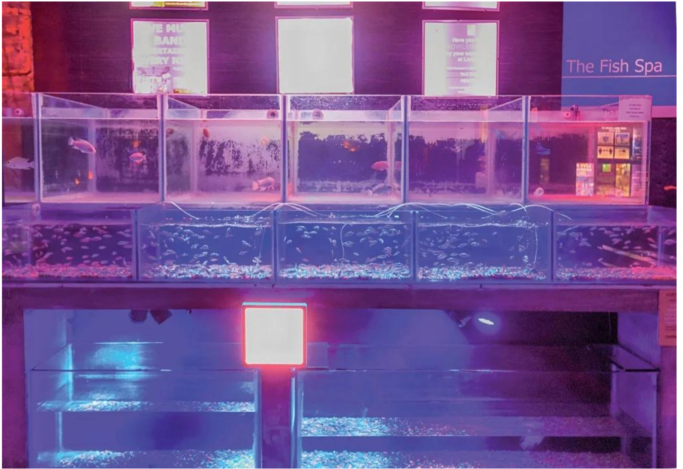
The Fish Spa section.