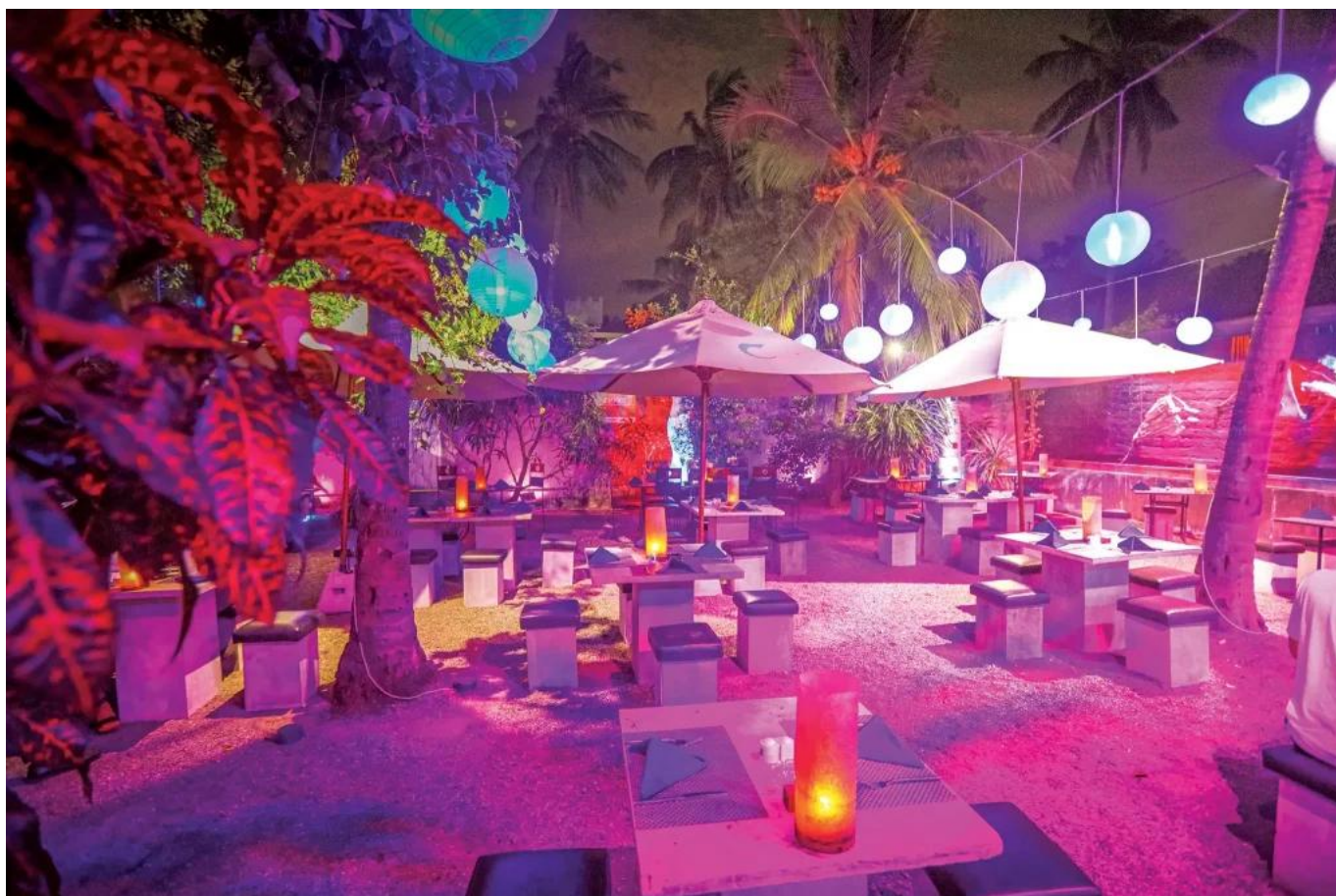
Dine under the stars at the Outdoor Boundaries Garden Restaurant and Bar.