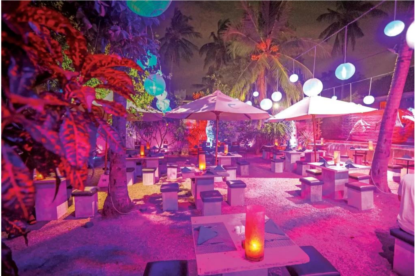
Dine under the stars at the Outdoor Boundaries Garden Restaurant and Bar.