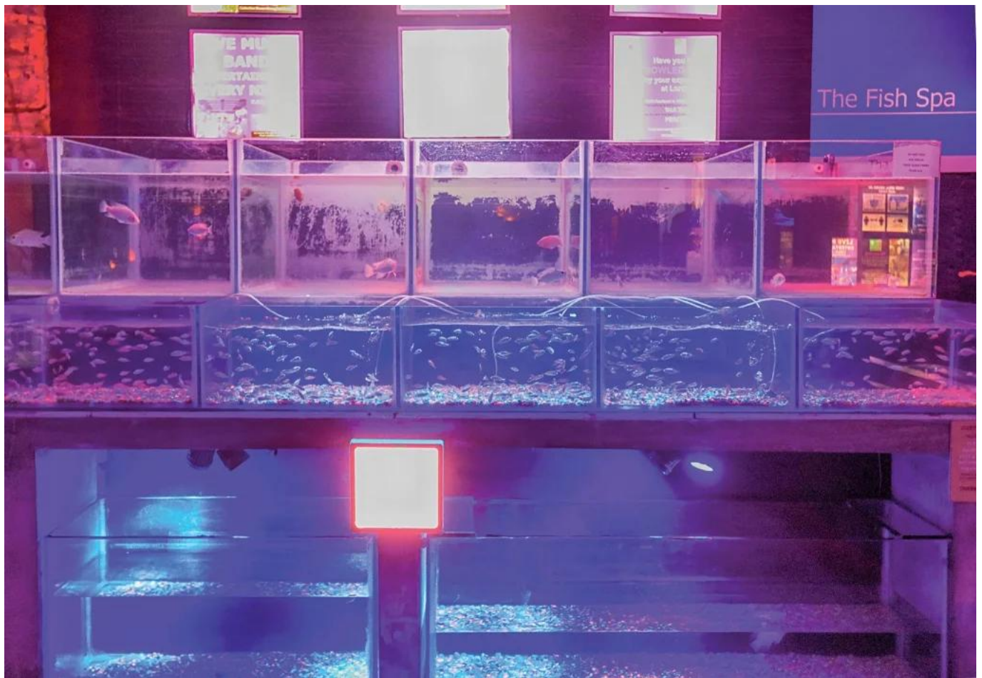
The Fish Spa section.