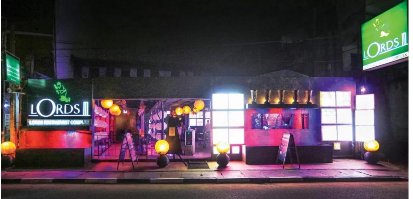
Lords, Negombo is all set up in full swing to serve its patrons again.