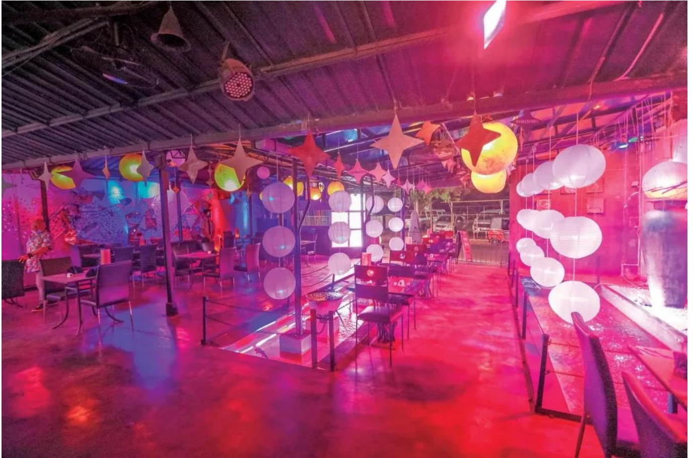
Batsman Restaurant with a quiet and romantic ambiance.