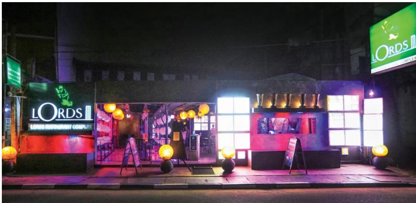
Lords, Negombo is all set up in full swing to serve its patrons again.