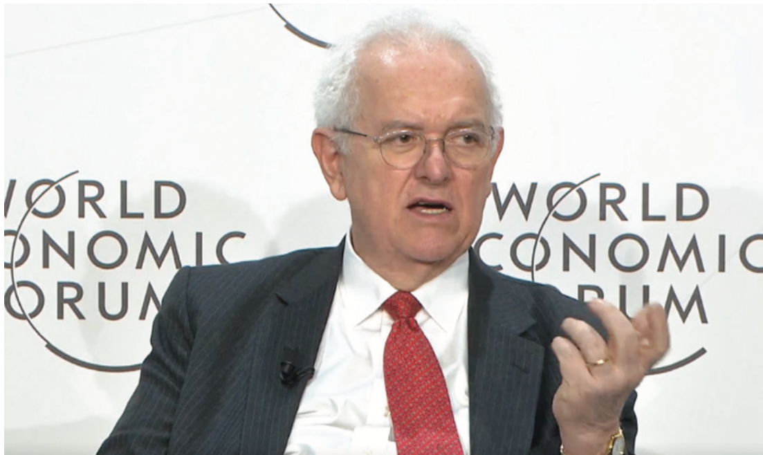
José Antonio Ocampo, Minister of Finance and Public Credit, Ministry of Finance and Public Credit of Colombia.