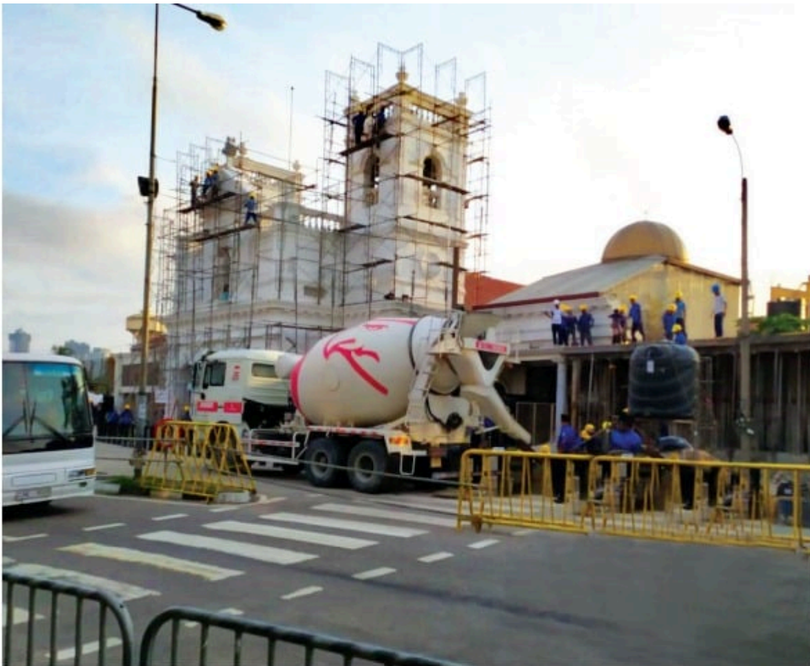
St. Anthony's Church, Colombo 13 under restoration.

INSEE Cement, Sri Lanka's premier producer of cement that has constructed over a third of the nation's homes has always been dedicated to building the nation. As the nation reeled from the catastrophic destruction of lives and churches after the Easter Sunday bombing, INSEE Cement stepped forward to help rebuild and restore the nation's damaged churches due to the unprecedented onslaught.