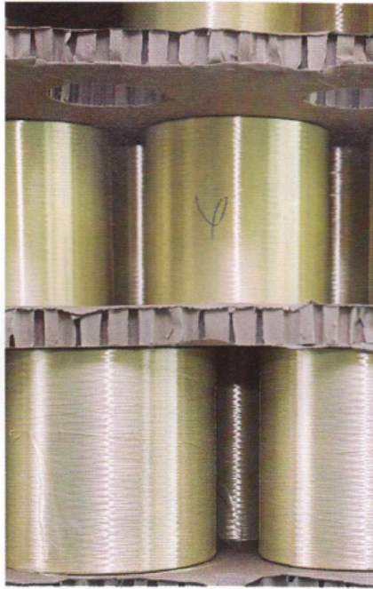
Bullet proof yarn