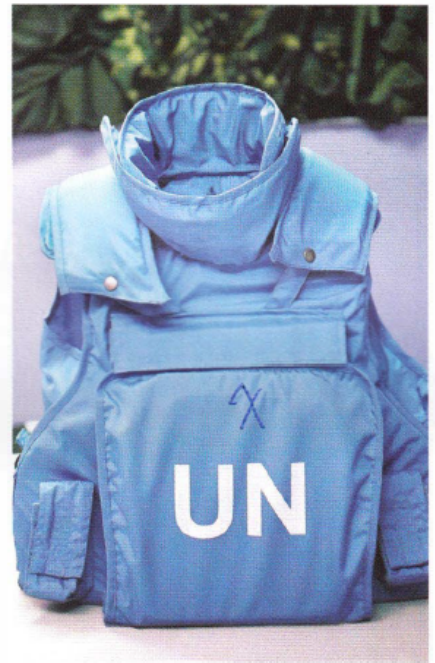
Body armour manufactured for the United Nations