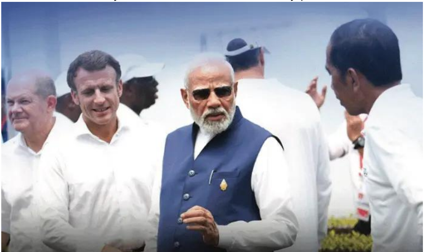
Prime Minister of India Narendra Modi with Chancellor of the Federal Republic of Germany Olaf Scholz; President of France Emmanuel Macron and President of Indonesia Joko Widodo.