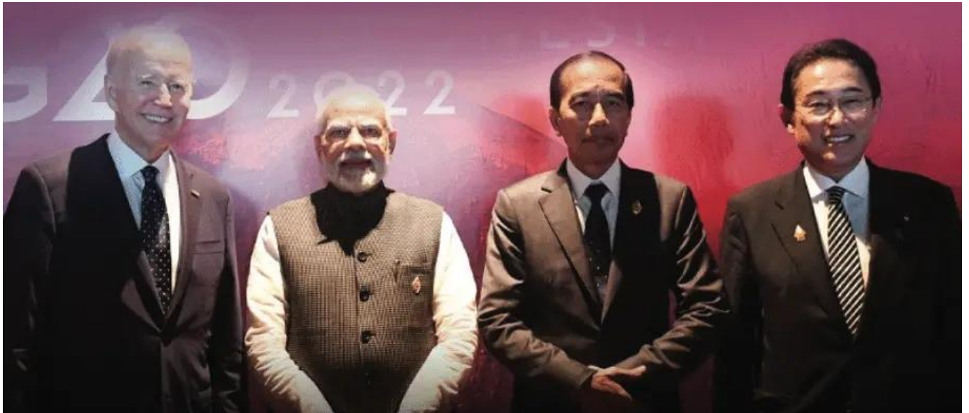
President of the United States Joe Biden; Prime Minister of India Narendra Modi; President of Indonesia Joko Widodo; and Prime Minister of Japan Fumio Kishida.