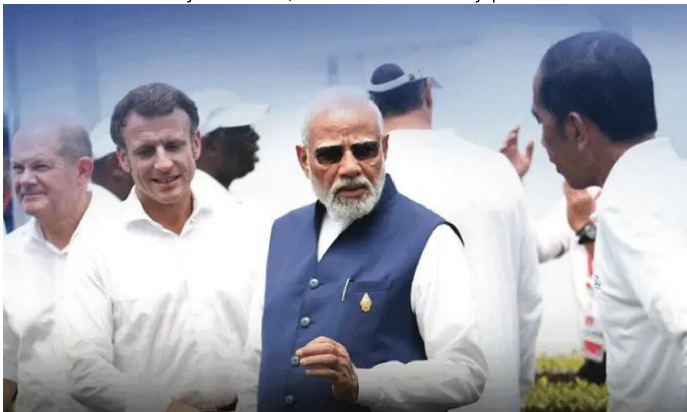
Prime Minister of India Narendra Modi with Chancellor of the Federal Republic of Germany Olaf Scholz; President of France Emmanuel Macron and President of Indonesia Joko Widodo.