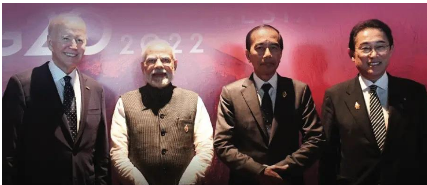
President of the United States Joe Biden; Prime Minister of India Narendra Modi; President of Indonesia Joko Widodo; and Prime Minister of Japan Fumio Kishida.