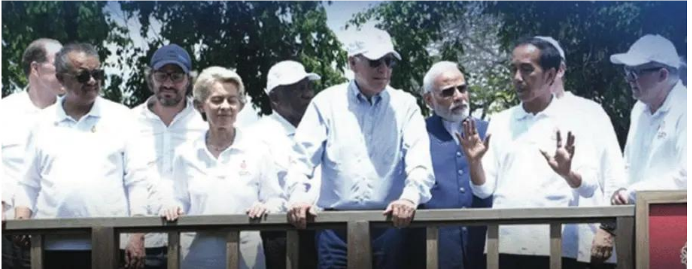
(L-R): World Health Organization (WHO) Director-General Tedros Adhanom Ghebreyesus, European Commission President Ursula von der Leyen, President of the United States Joe Biden, Prime Minister of India Narendra Modi, President of Indonesia Joko Widodo, and Prime Minister of Australia Anthony Albanese attend a mangrove planting event at the Tahura Ngurah Rai Mangrove Forest Park as part of the G20 Leaders' Summit in Denpasar, Indonesia.