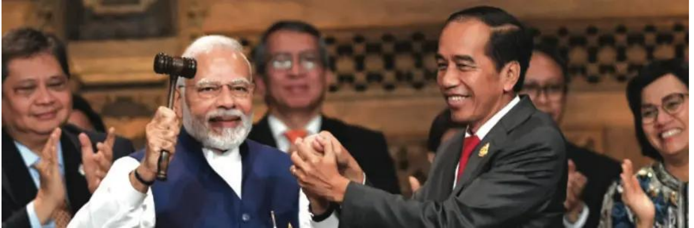
Prime Minister of India Narendra Modi and President of Indonesia Joko Widodo.

Today, India commences its G20 Presidency.