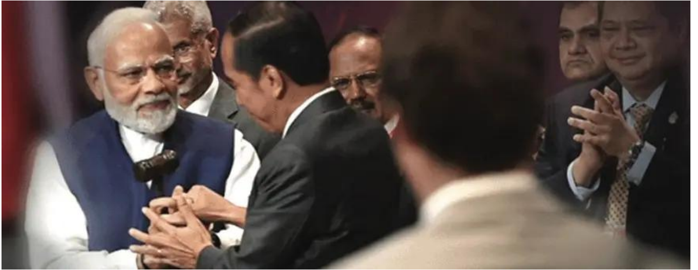
Prime Minister of India Narendra Modi and President of Indonesia Joko Widodo.