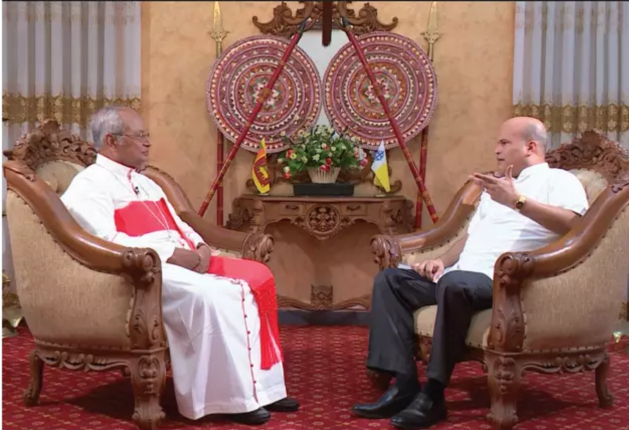
His Eminence Malcolm Cardinal Ranjith with Milinda Moragoda.

His Eminence Malcolm Cardinal Ranjith engages in an interesting discussion with Milinda Moragoda on 'In Black and White', telecast on TV One (MTV). They focus on topics that are foremost in the public's mind, giving much for everyone to think