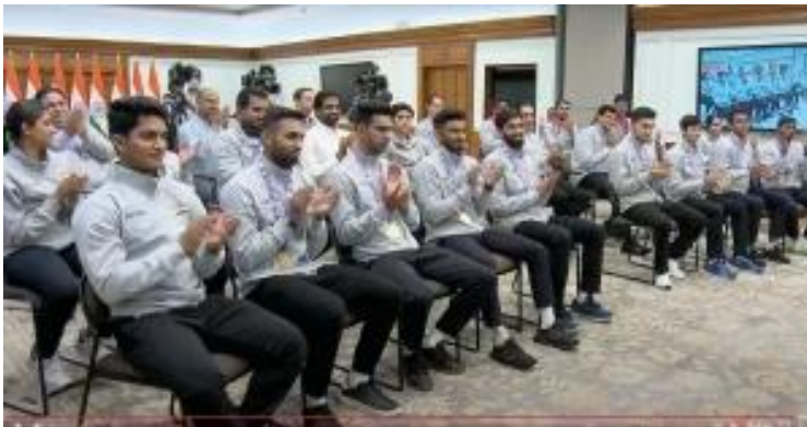
Winners of the Indian Badminton Team

This spirit of 'yes, we can do it' has become a new force in India. And you represent that. No matter how strong our competitor is and his past records, what is important today for India is the performance! We have to move forward to reach our goals with this spirit. But friends, you all have to remember one more thing. Now the expectation of the country from all of you has increased and, therefore, there will be more pressure. This pressure is not bad. But being buried under this pressure is bad. We have to convert pressure into energy; we have to convert it into power. We should take it as encouragement. Somebody says buck-up, but it does not mean that he is putting pressure on you. In fact, he is encouraging you to put in your best efforts. We should consider it as our source of strength. And I am sure you will prove it.