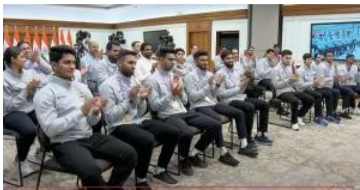
Winners of the Indian Badminton Team

In the last few years, India's youth have been performing well in almost every sport. And there has been an attempt to do something new, something better.