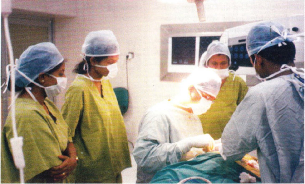
Restoring hearing loss in a patient using the Cochlear Implant - the first surgery of its kind in Sri Lanka