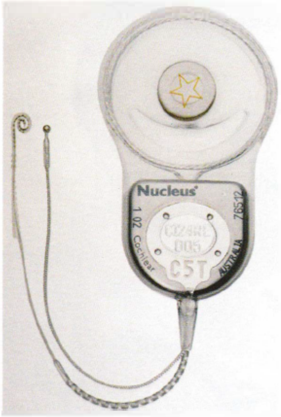
Nucleus Freedom cochlear implant