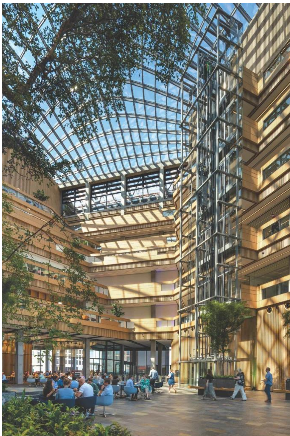
Trees and planter shrubs provide greenery and a sense of nature into the atrium space.