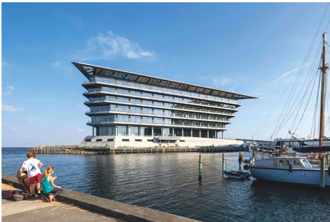
View of the Building from harbour, the base of the plinth incorporates a public promenade with landscaping and benches.