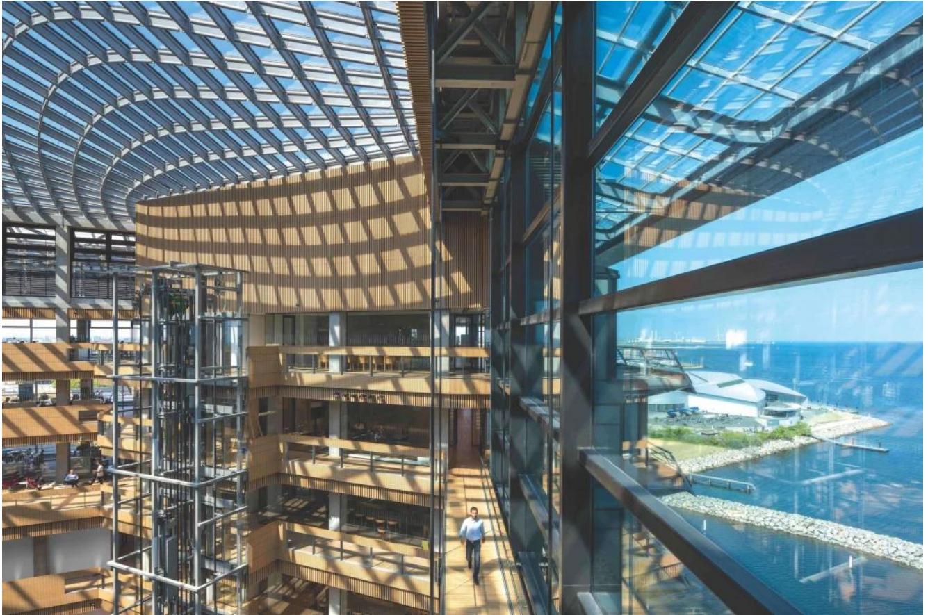
Bridges connect across the atrium glazed wall allowing dramatic sea and internal atrium views.