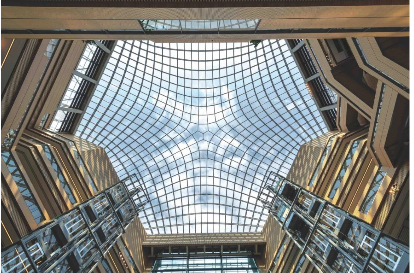
View of the glazed roof geometry. Triple glazed panels are cold bent into place onto an optimised lightweight steel grid shell structure.