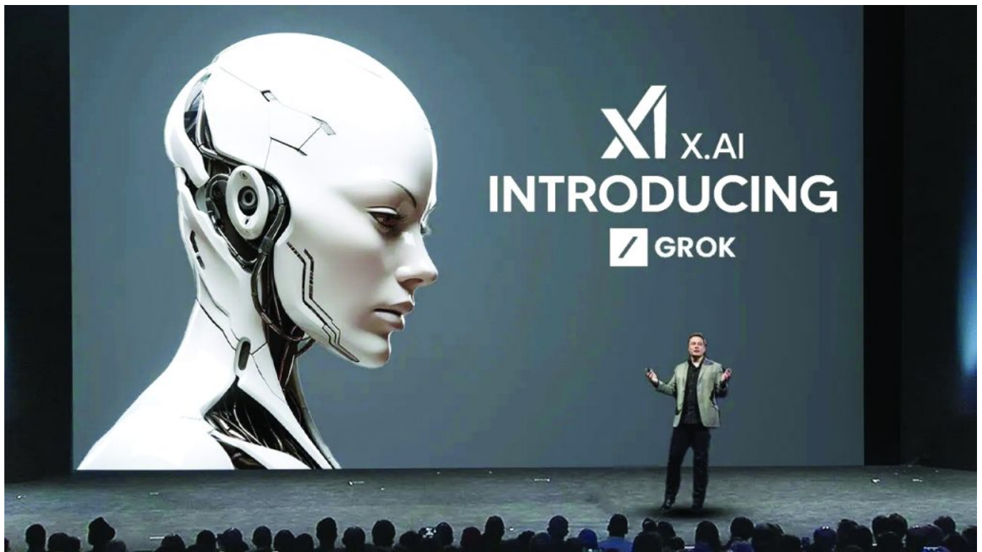
Elon Musk highlighting the new AI model Grok 3.