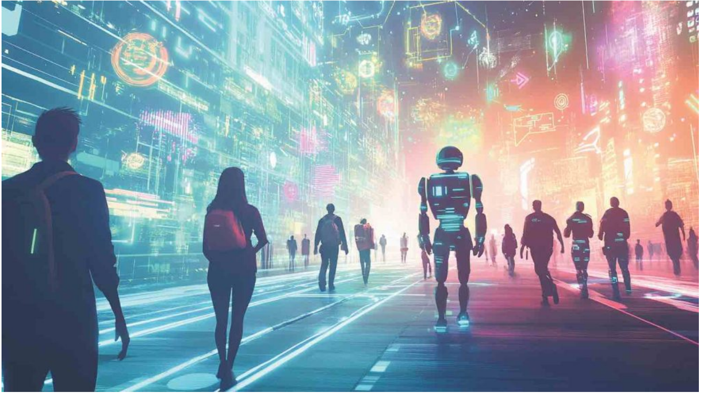
A humanoid robot working alongside humans – showcasing AI's integration into daily life.