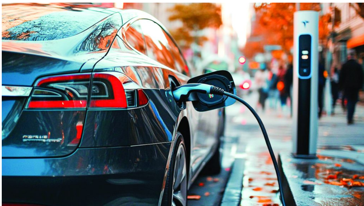
An electric vehicle charging at a station.